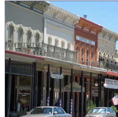
Granbury, Texas

have seen first-hand the real human impact of these harmful loans.