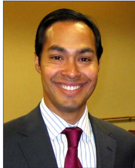
Julian Castro