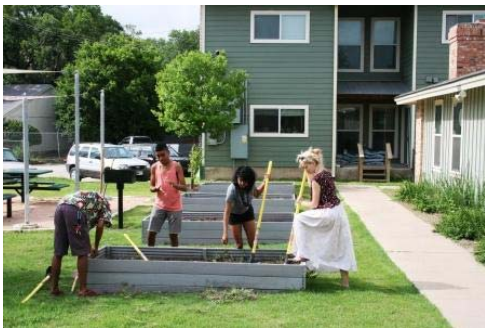
Residents working together in the community gardens at Pecan Springs Commons