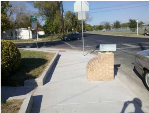
Johnston Terrace Safe Routes to School Sidewalk