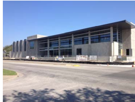
Construction of YMCA North Austin Recreation Center