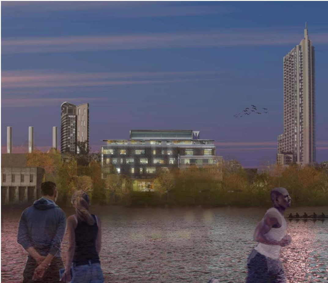
View of Library from across Lady Bird Lake looking North