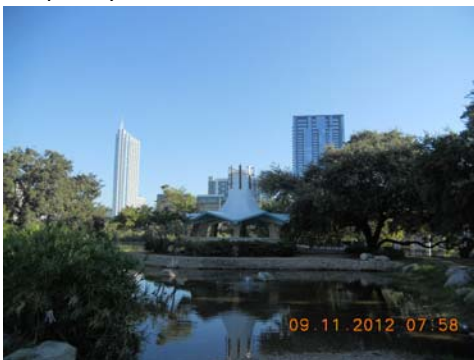
Fannie Davis Gazebo