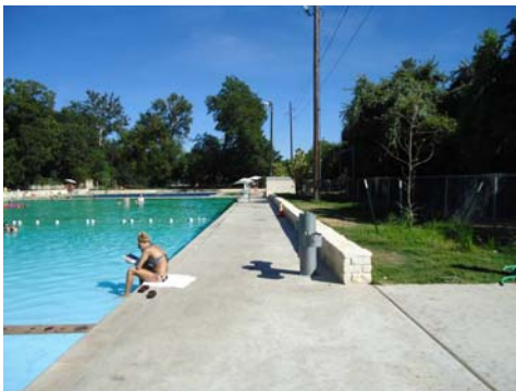
Deep Eddy Pool

Town Lake Metro Park – Fannie Davis Gazebo Town Lake Metro Park – Central Austin Youth League Concession Building Zilker Metro Park – Botanical Garden Roof Zilker Metro Park – Botanical Garden HVAC Replacement Zilker Metro Park – McBeth Rec Center Renovations Phase 2 Deep Eddy – Pool Shell Rosewood Neighborhood Park – Chestnut House Renovations Rosewood Neighborhood Park – Pool Renovation South Austin Neighborhood Park – Rec Center Renovations Austin Recreation Center – Roof Renovation Little Zilker Park – Playscape Renovation