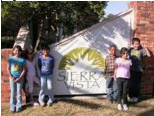
Children at the Sierra Vista Learning Center