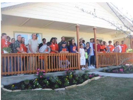
A home dedication ceremony in Sendero Hills