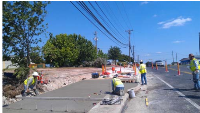
Kramer Multi Use Trail

General Pedestrian/Bike/Trails Program: 59.2% has been expended or obligated.