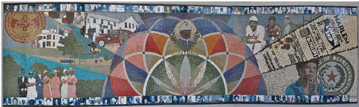
Mural at the African American Cultural and Heritage Facility