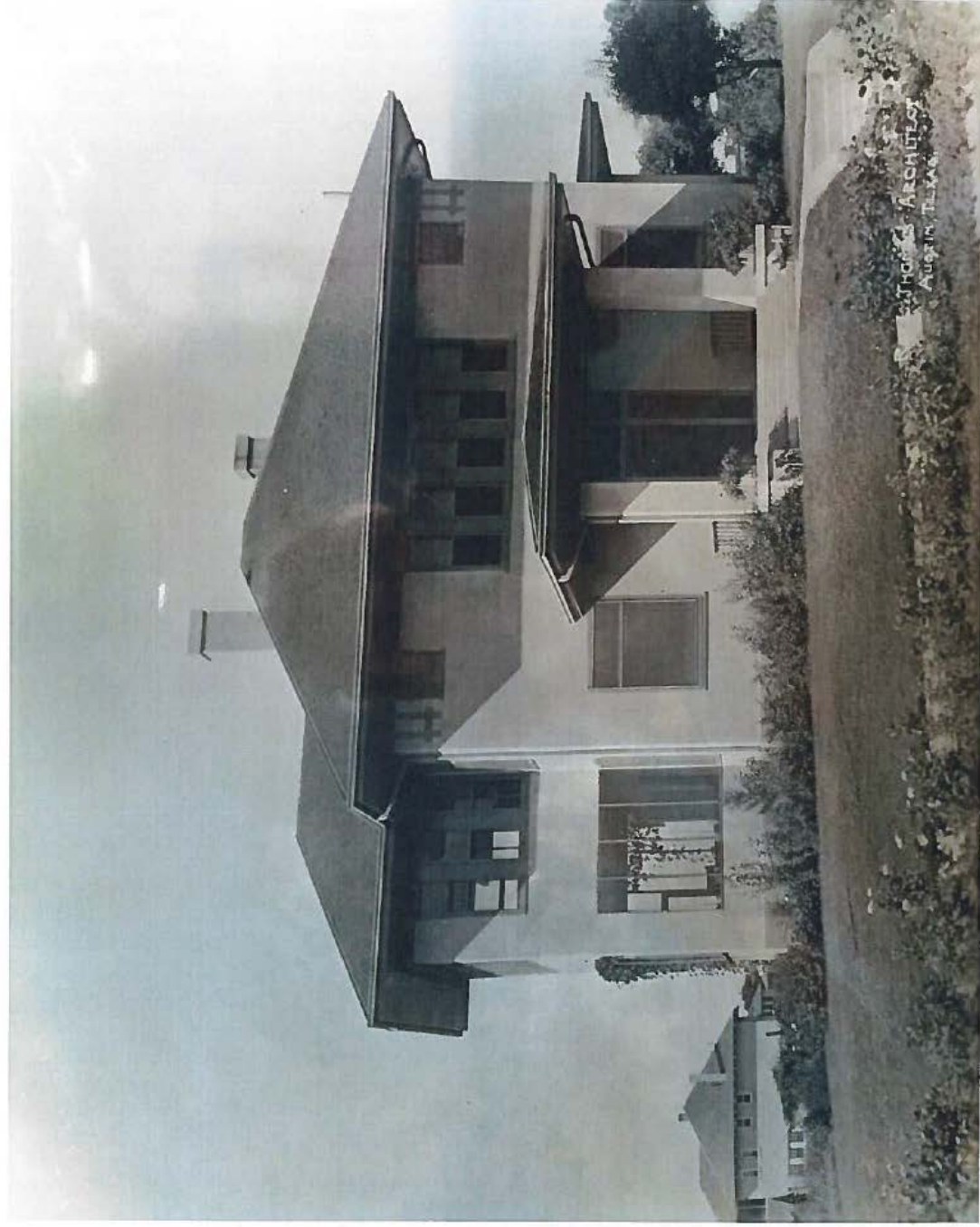
(No caption.)