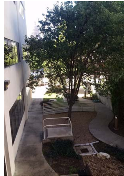
Outdoor garden and playground.