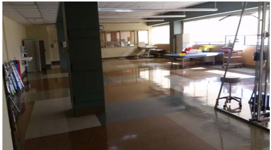
Physical rehabilitation space on each floor.