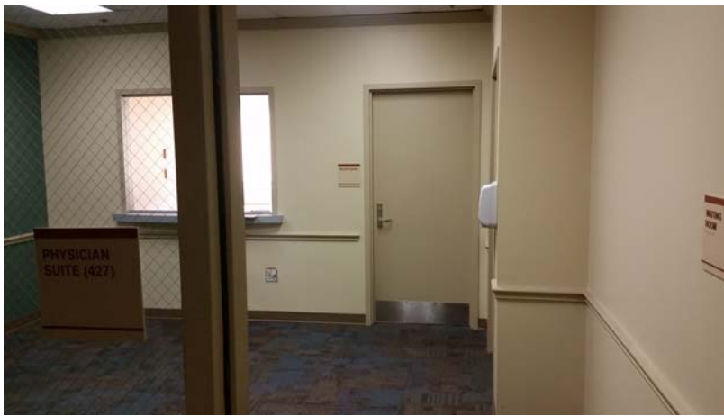
4 th floor suite with reception, offices, and exam rooms.