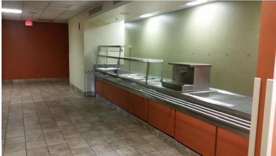
Serving line of main dining area on 1 st floor.