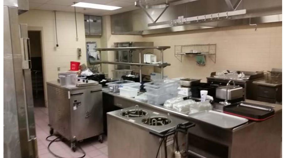
Commercial kitchen on 1 st floor.