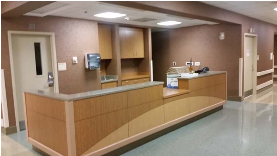
Reception area on each floor.