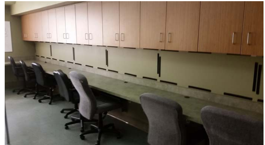
Collaborative office space on each floor.