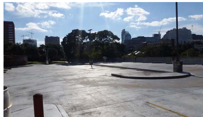
Upper level of parking garage, with 12 th St. access.