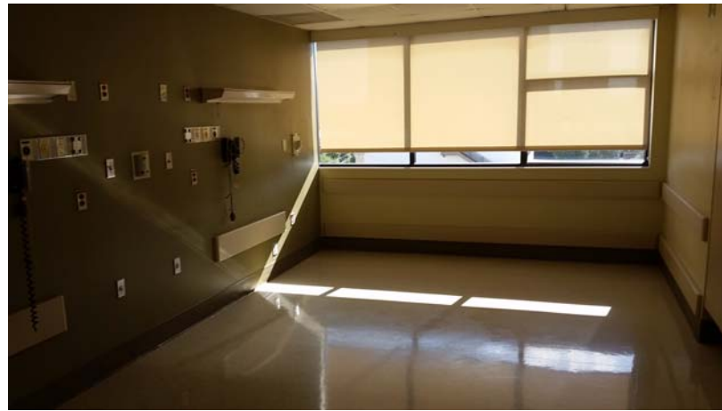
Typical patient room (44 total).