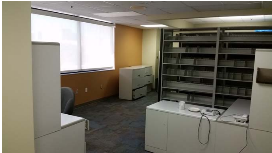
Large office space on 4 th floor.