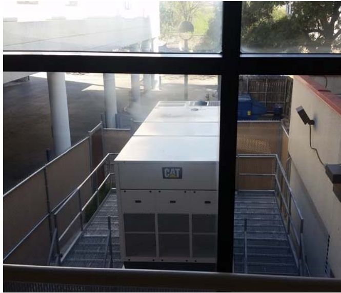
Backup generator replaced in 2015.