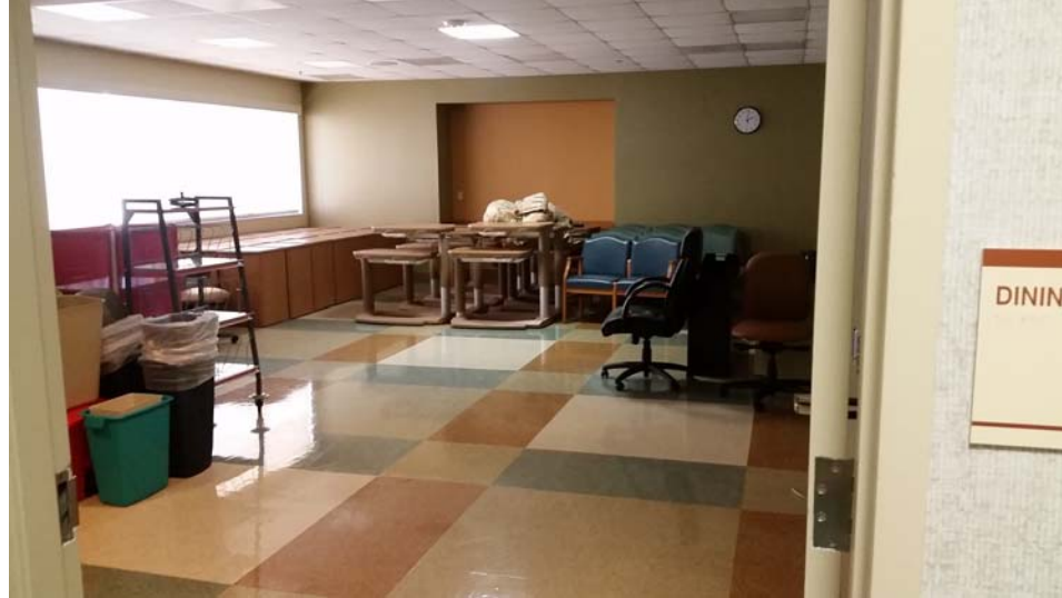
Dining area on each floor.