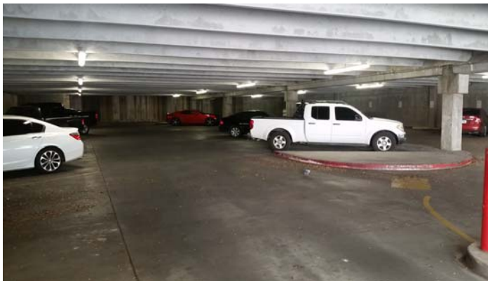
Lower level of 62-spot parking garage.