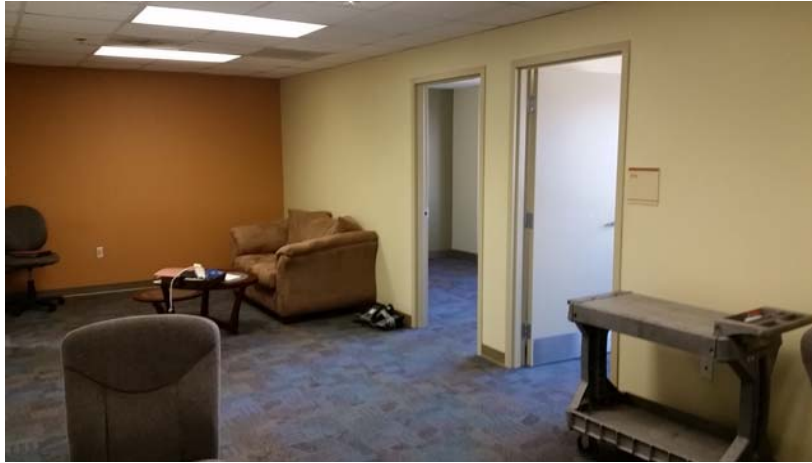
4 th floor office suite with reception area.