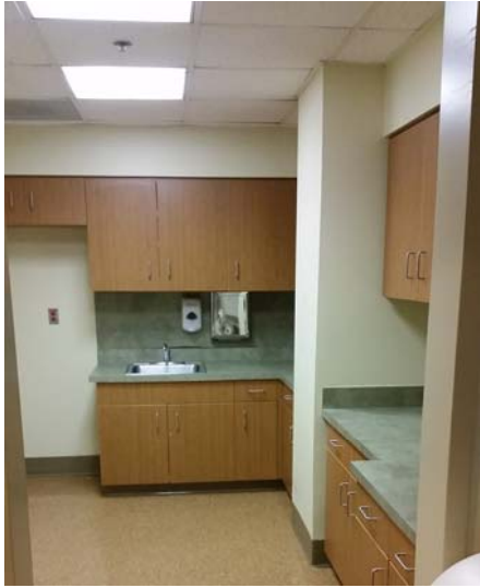
Kitchen area on each floor.