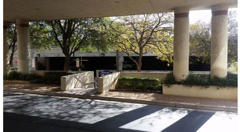
Drop-off area and access to parking garage.