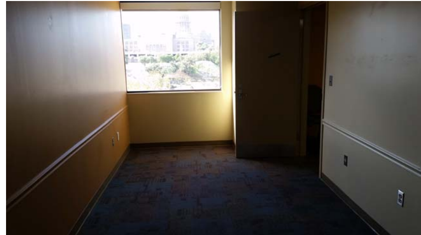
West-facing offices view Capitol.