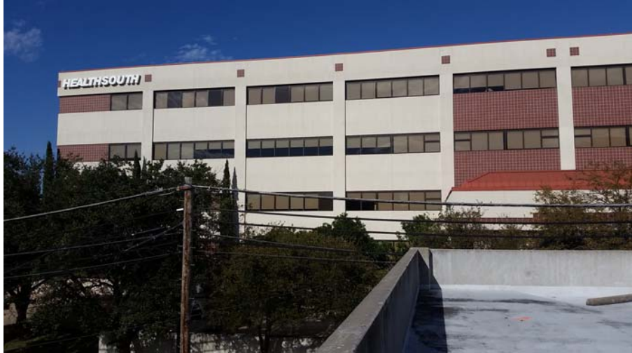
Exterior as viewed from parking garage.