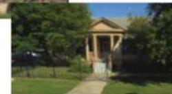
ACC Historic Homes