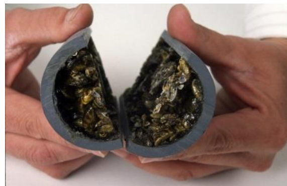
Figure 2: Zebra Mussels in Small-Diameter Pipe

Zebra mussels clog pipes, screens, and other intake structures, as is shown in Figure 2. If mitigation strategies are not implemented, zebra mussels can increase electrical costs associated with pumping raw water and reduce a water treatment plant's ability to treat water. Zebra mussels can also damage equipment and cause taste and odor issues for water treatment facilities.