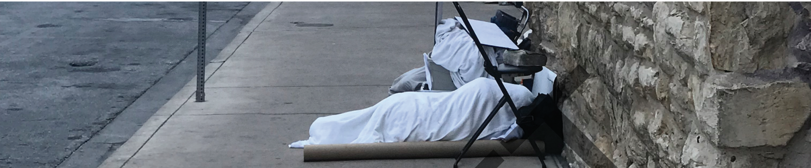
Exhibit 1: Department Efforts Related to Homelessness Often Overlap