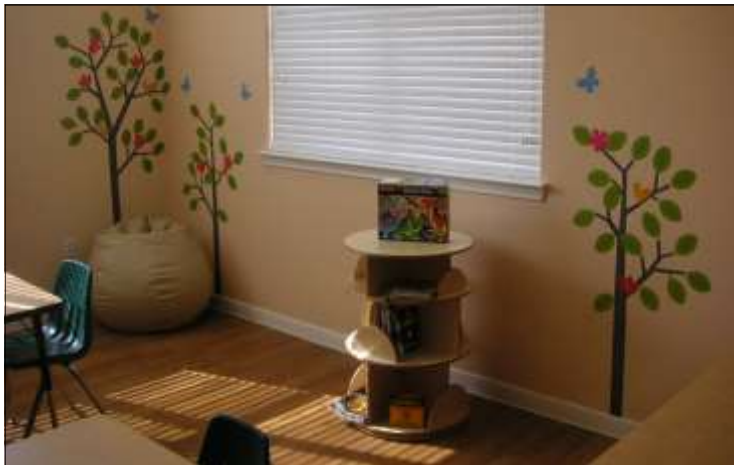
Prospect Point, 215 Premier Drive, Jasper, TX