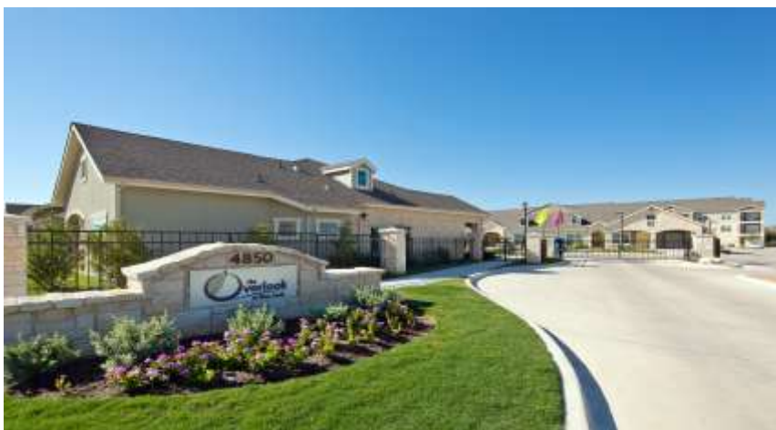
The Overlook at Plum Creek, 4850 Cromwell Drive, Kyle, T