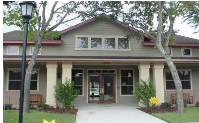
Eden Place, 1220 Jefferson Avenue, Seguin, TX