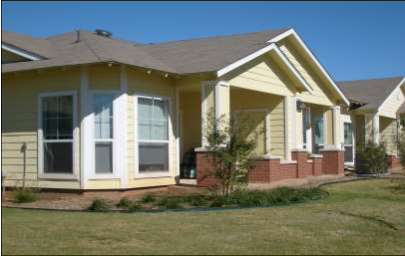
Arbors at Rose Park, 2702 S. 7th Street, Abilene, TX