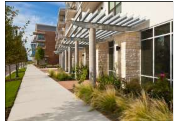
Wildflower Terrace, 3801 Berkman Drive, Austin, TX