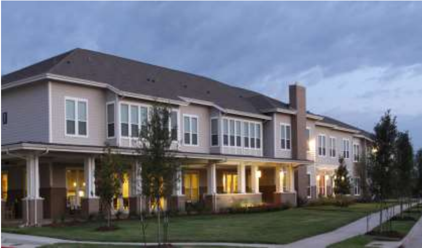
The Terrace at MidTowne, 991 Abigail Way, Midlothian, TX

DMA Development Company has perfected its senior independent living design in recent years. The typical DMA senior community consists of one two- or three-story elevator structure surrounded by single story cottages. The elevator structure is attractive to seniors who want the security of proximity to the onsite staff and amenities, while the single story cottages, which often have integrated carports, are attractive to independent residents who are perhaps downsizing from single family homes.