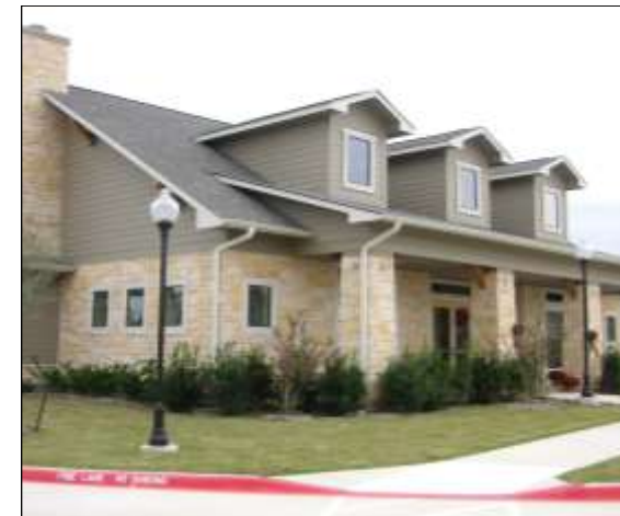
The Grove at Brushy Creek, 1101 El Dorado Street, Bowie, TX