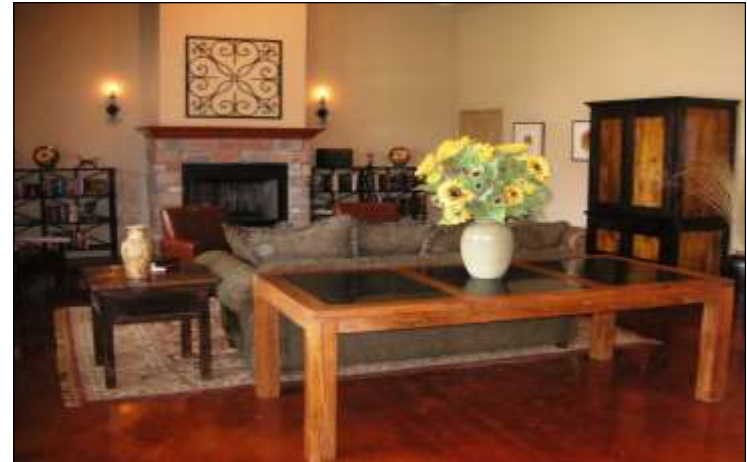
Ranch, 225 Westview Avenue, Pearsall, TX