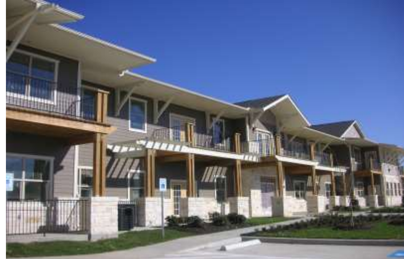
Cambridge Crossing, 1900 Cambridge Street, Corsicana, TX