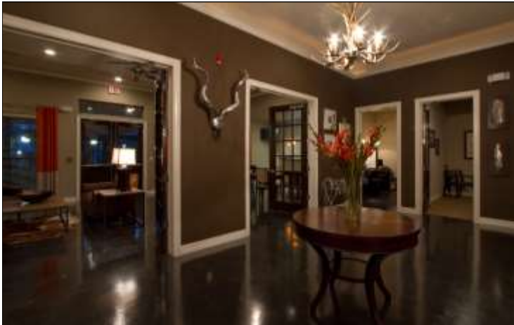
Sunchase Square, 1001 S. Guadalupe Street, Lockhart, TX