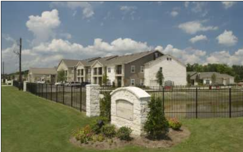
Heritage Crossing, 12402 11th Street, Santa Fe, TX