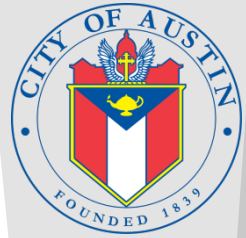
City of Austin 2013-2018