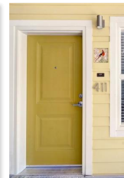
Jeremiah Housing Moody Campus