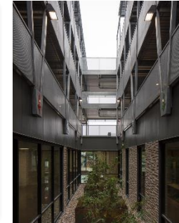
Bluebonnet Studios S. Lamar Blvd.