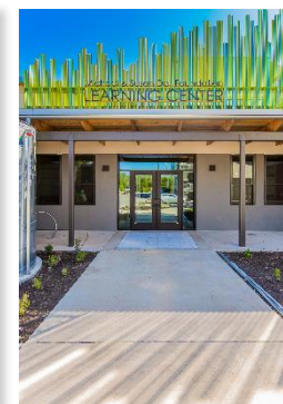
Lakeline Station Apartments Rutledge Spur