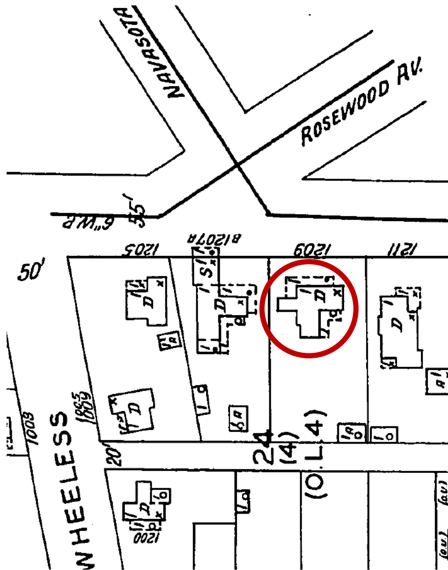
The 1935 Sanborn map shows the original location of Ulysses S. and Veola Young's house. It was moved to the back of the lot in 1949 to make room for the Hillside Drug Store building.