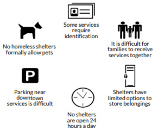
Exhibit 4: A person experiencing homelessness may face barriers when trying to access programs and services