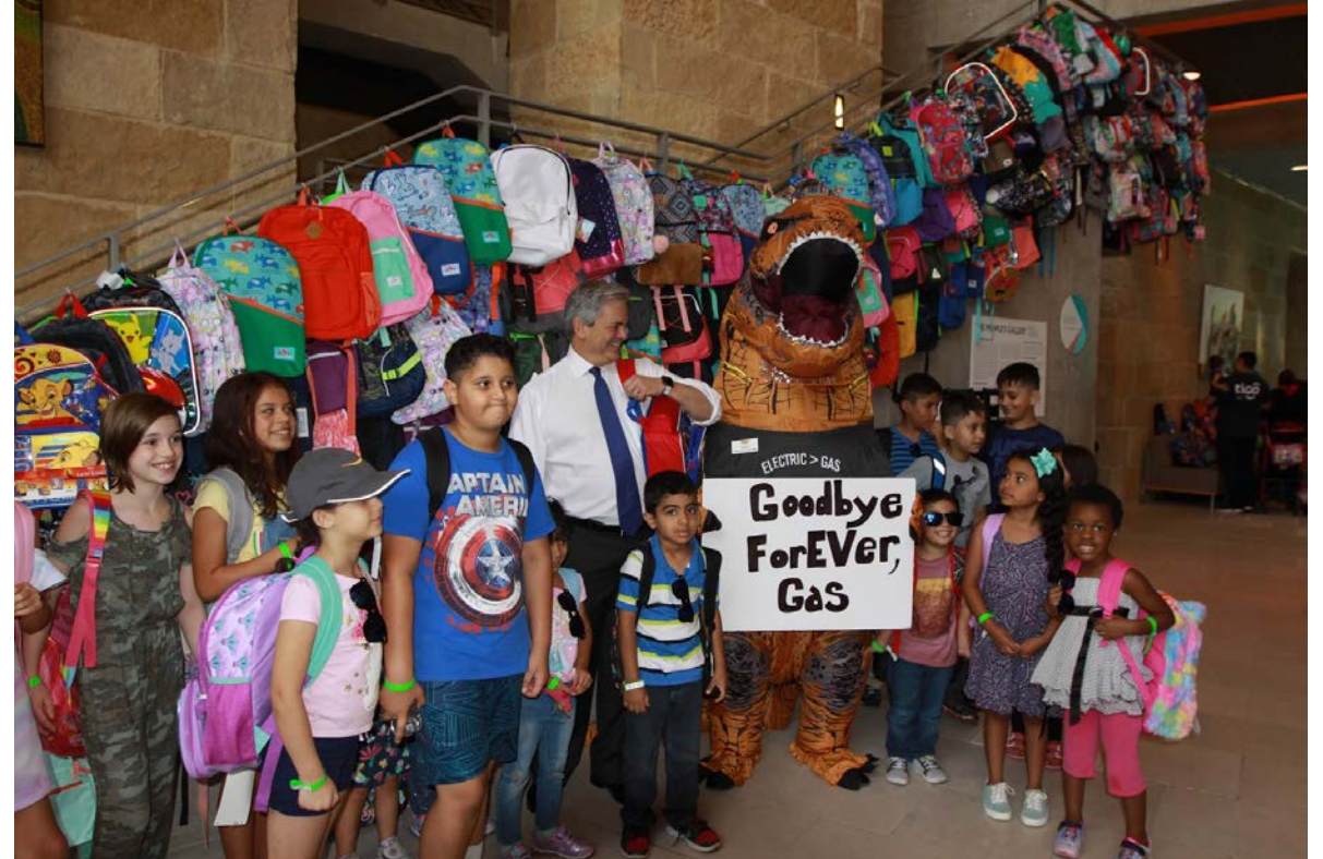
Build-a-Backpack school supply drive