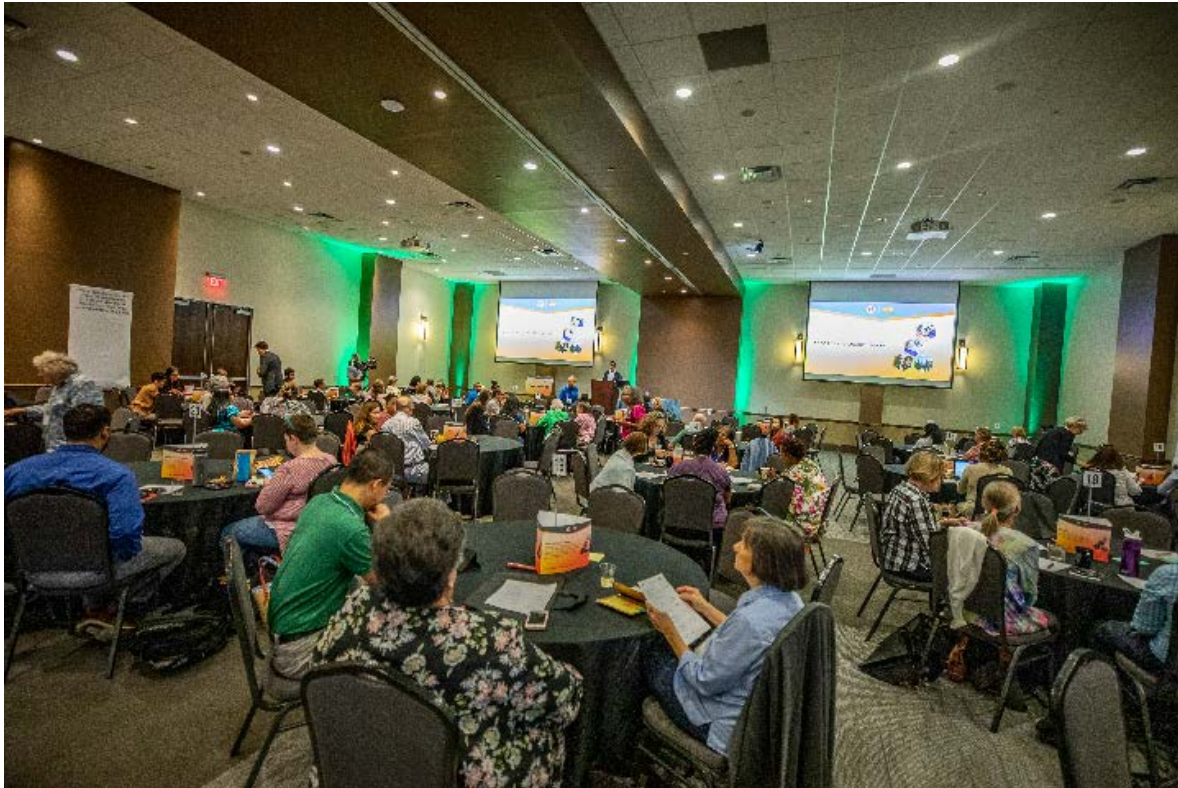
Affordable Energy Summit