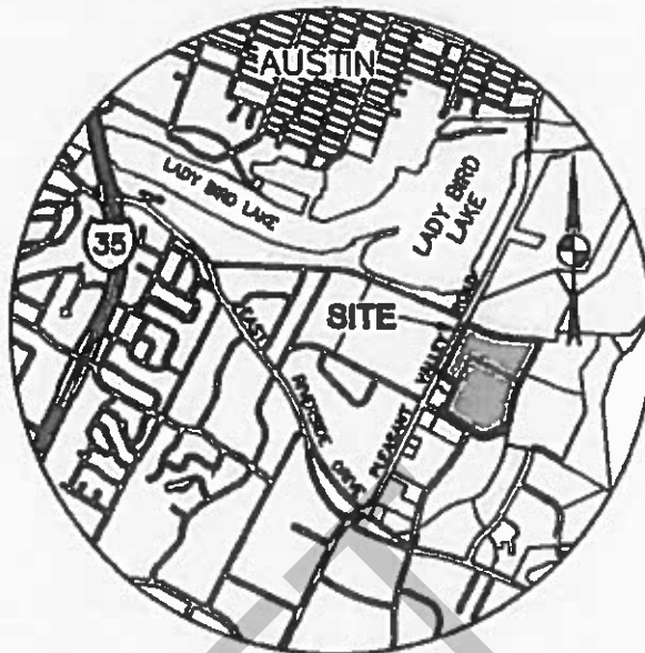
VICINITY MAP 1"=3000'