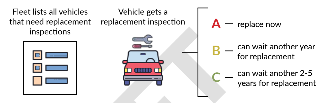
Exhibit 1: Fleet's replacement inspection process