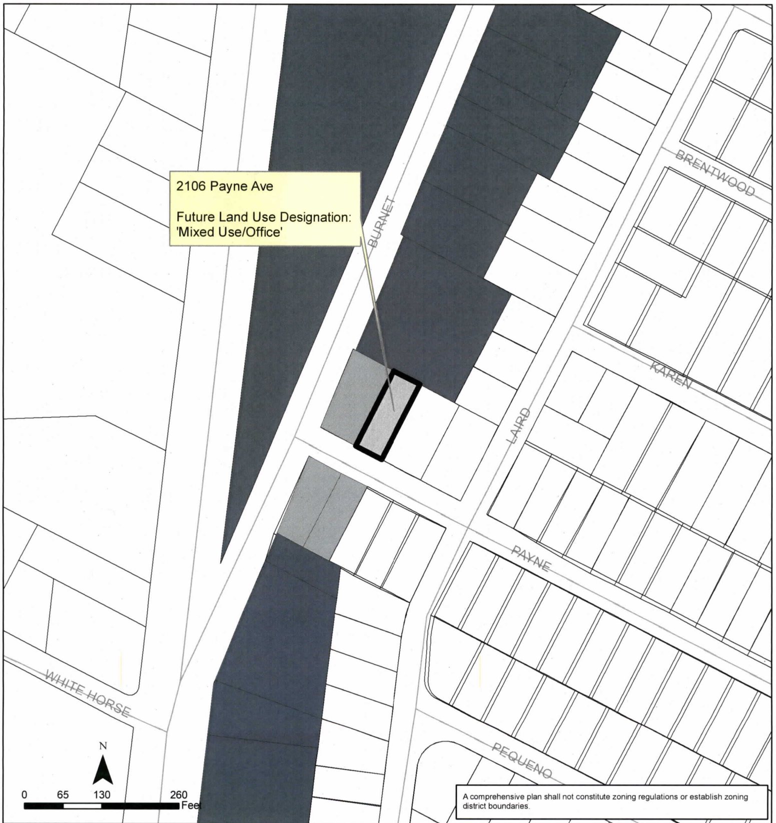
Exhibit A Brentwood/Highland Combined Neighborhood Planning Area Amendment NPA-2017-0018.01

This product is for informational purposes and may not have been prepared for or be suitable for legal, engineering, or surveying purposes. It does not represent an on-the-ground survey and represents only the approximate relative location of property boundaries.