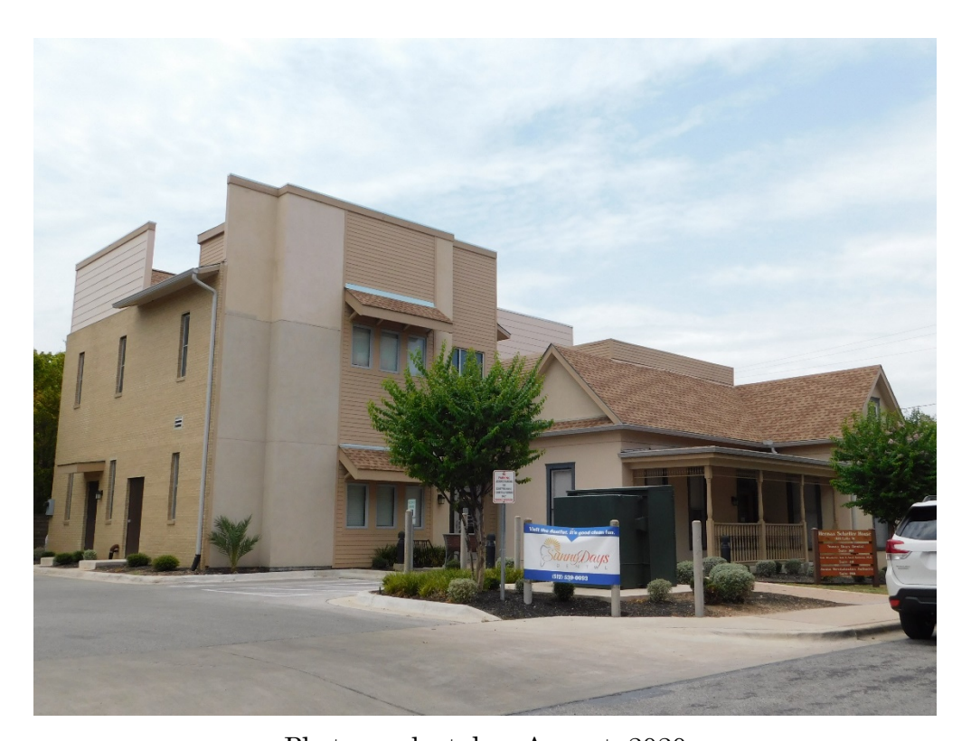
Photographs taken August, 2020