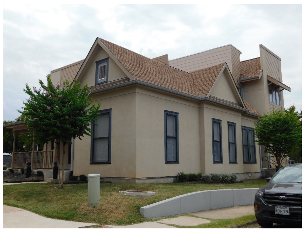
Photographs taken August, 2020