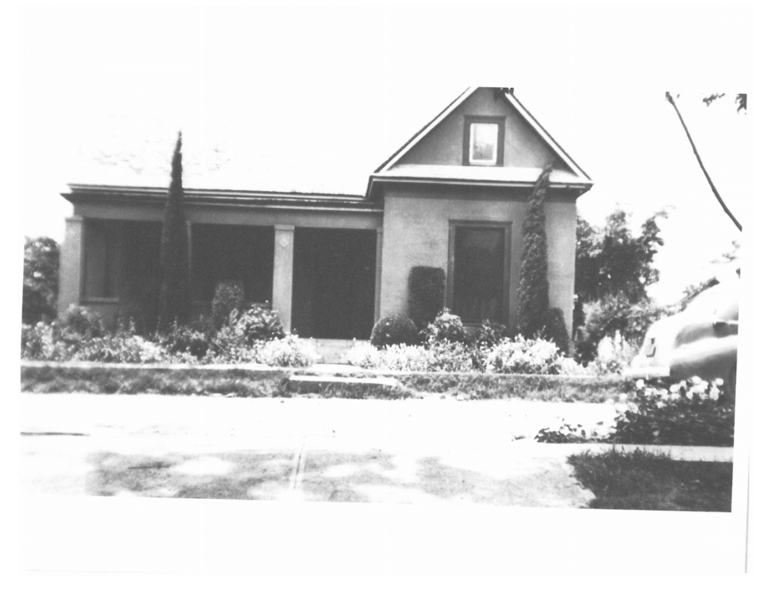
Historic photo of the Schieffer house showing the square porch columns that were either wood or stuccoed wood, and have since been replaced.

turned wood rails. The Schieffer house represents middle-class residential housing at the turn of the century, with a vernacular Victorian form and design elements.