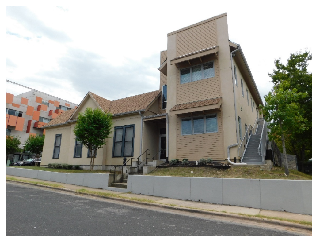
Photograph taken August, 2020