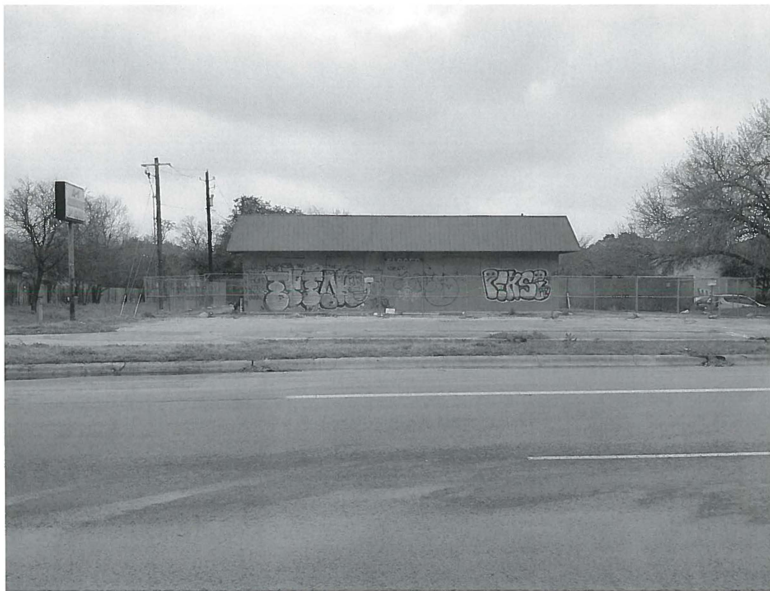
2056 West Stassney - Abandoned