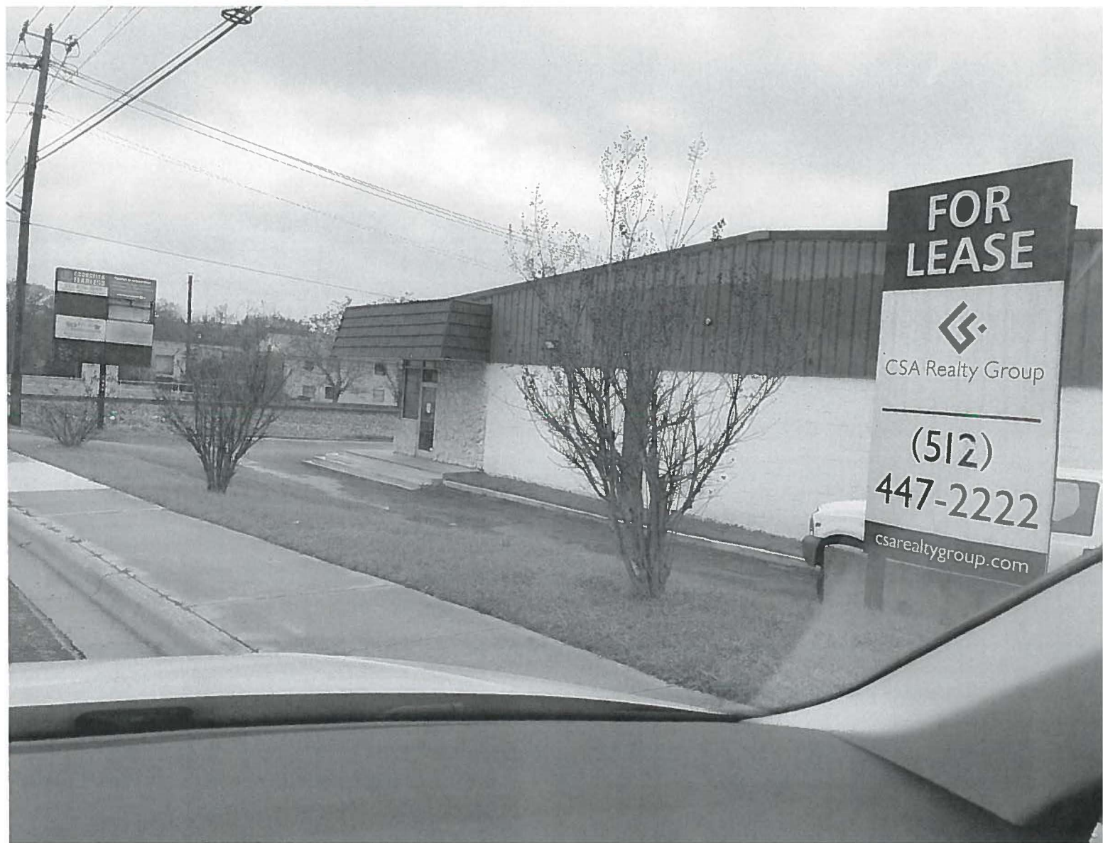
1606 West Stassney - For Lease