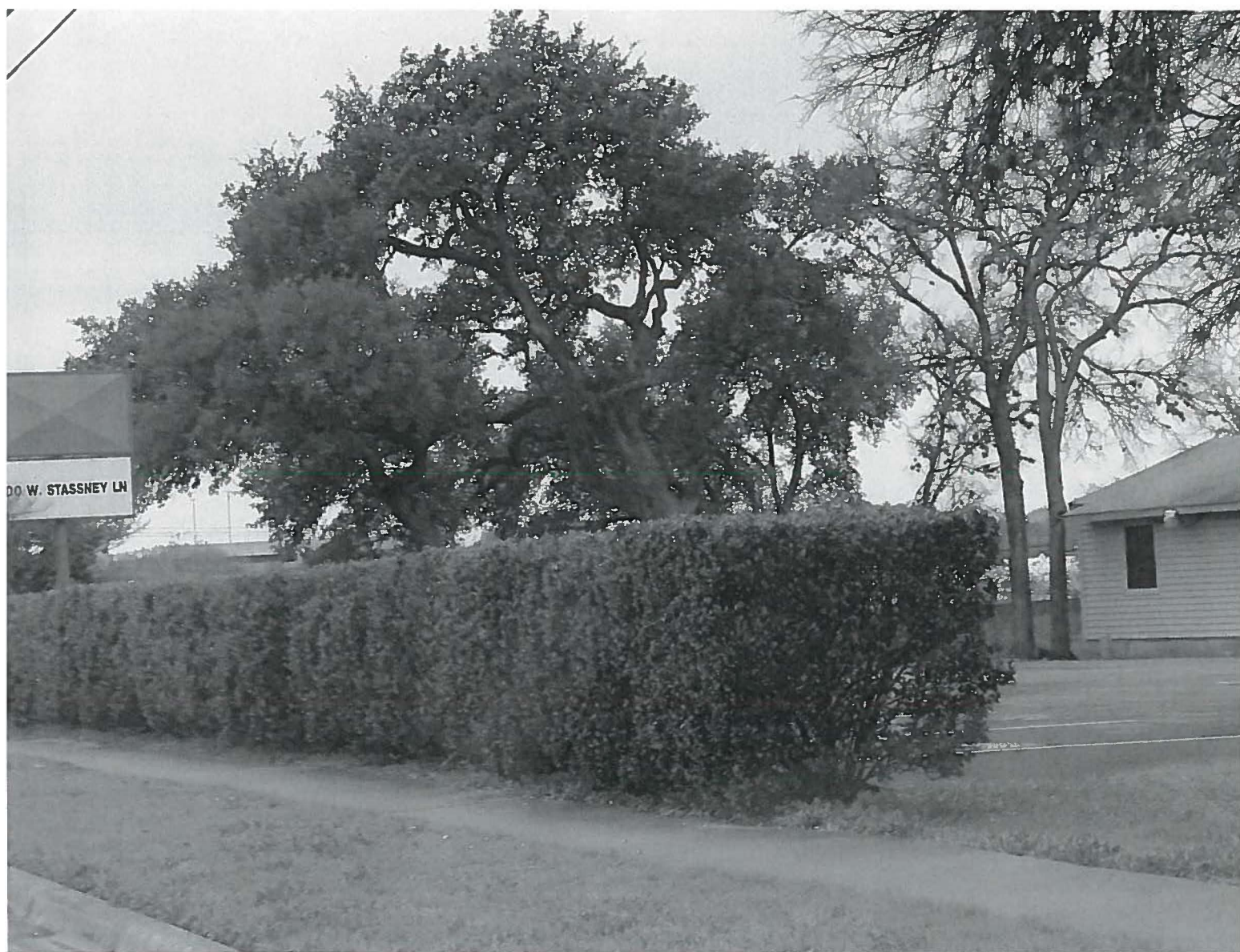
1500 West Stassney Vacant