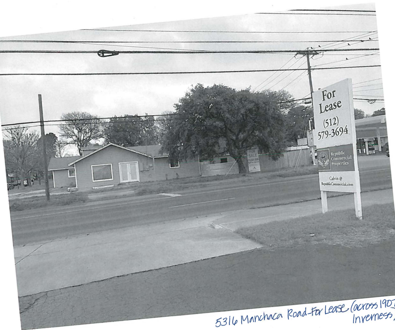
5316 Manchaca Road-For Lease (across 190) Inverness,