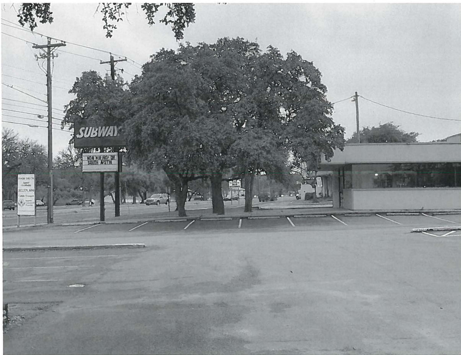
5608 Manchaca Road - Business closed