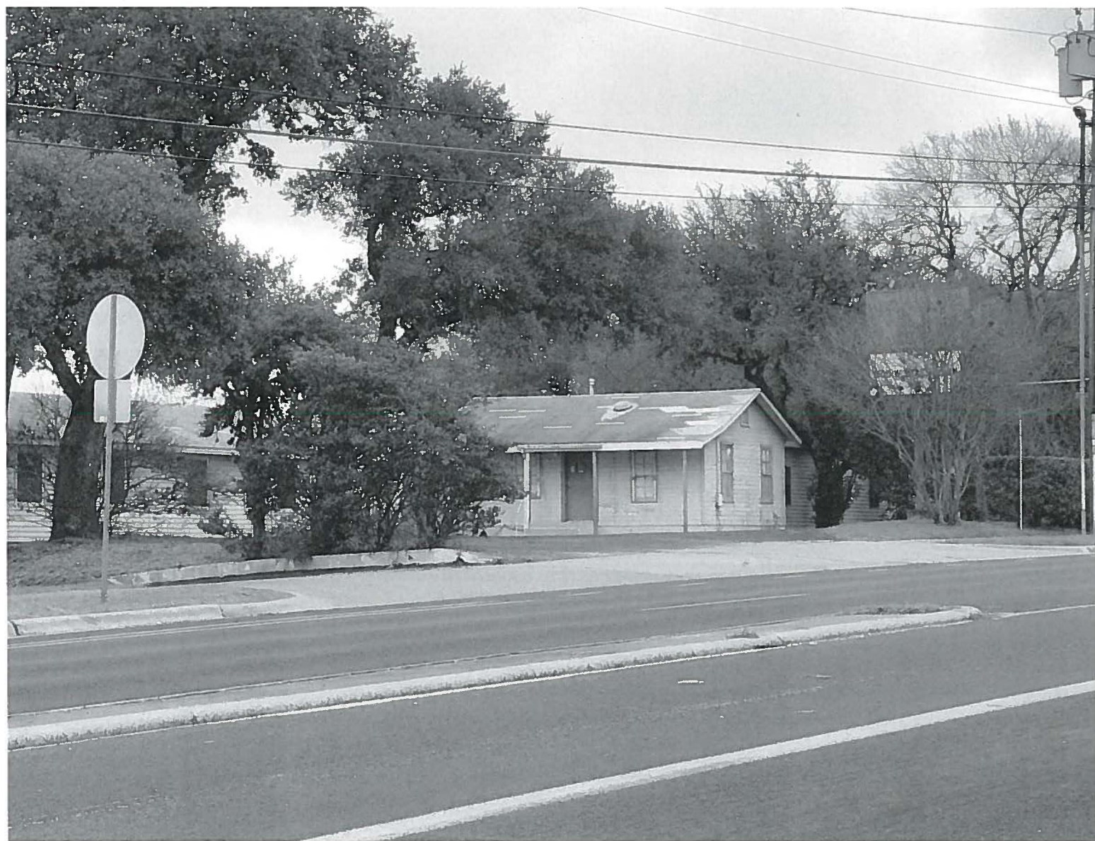
1500 West Stasshey - vacant