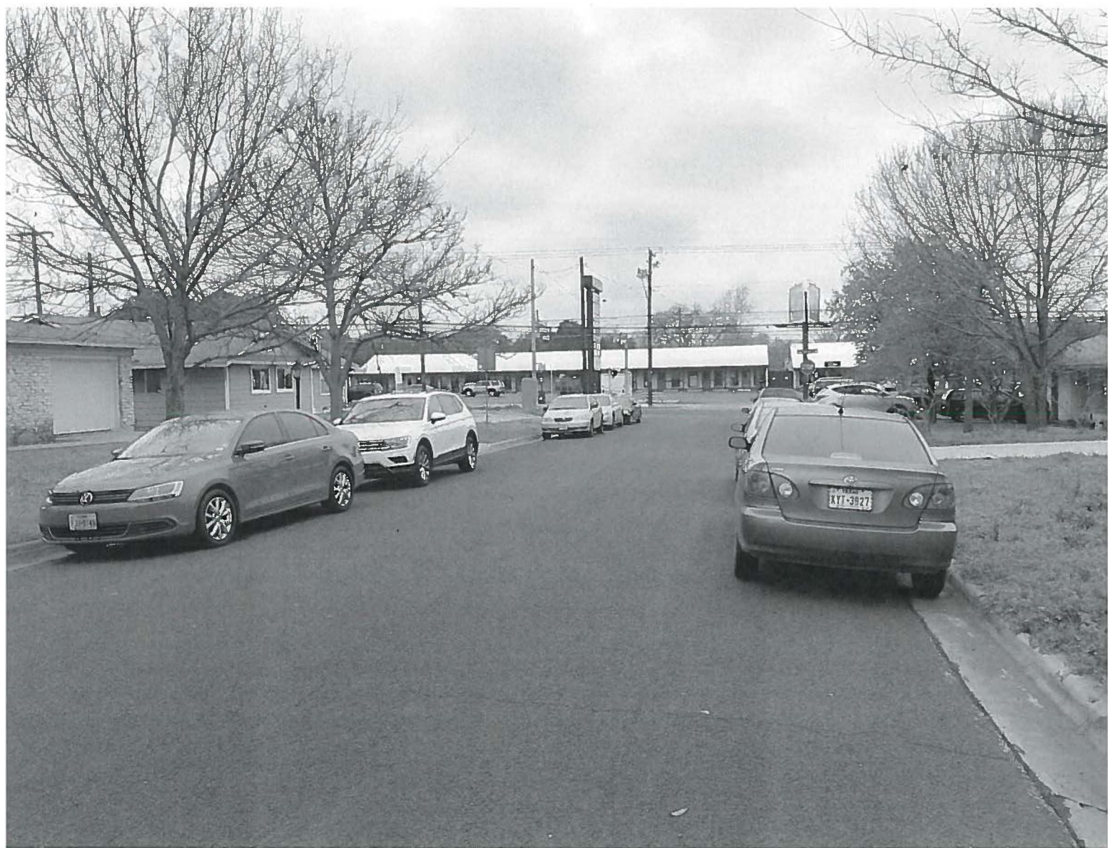
Inverness & Manchaca Parking