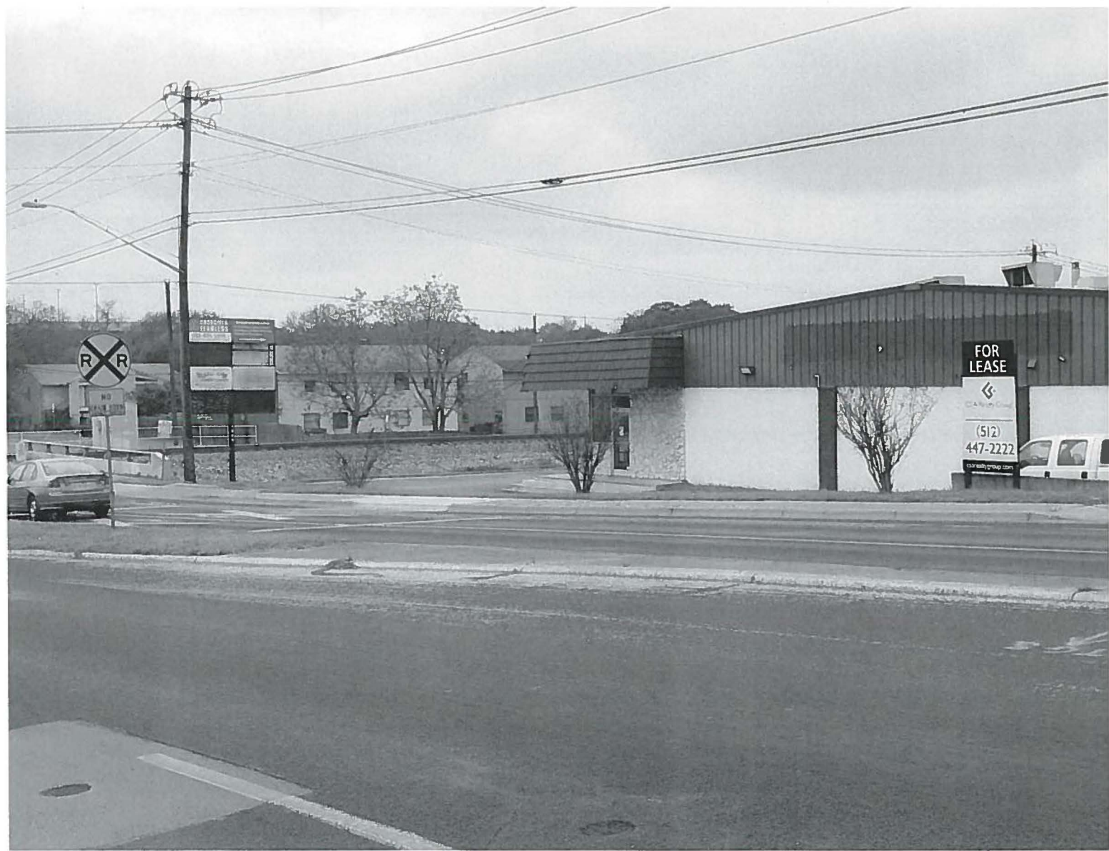
1606 West Stassney - For Lease