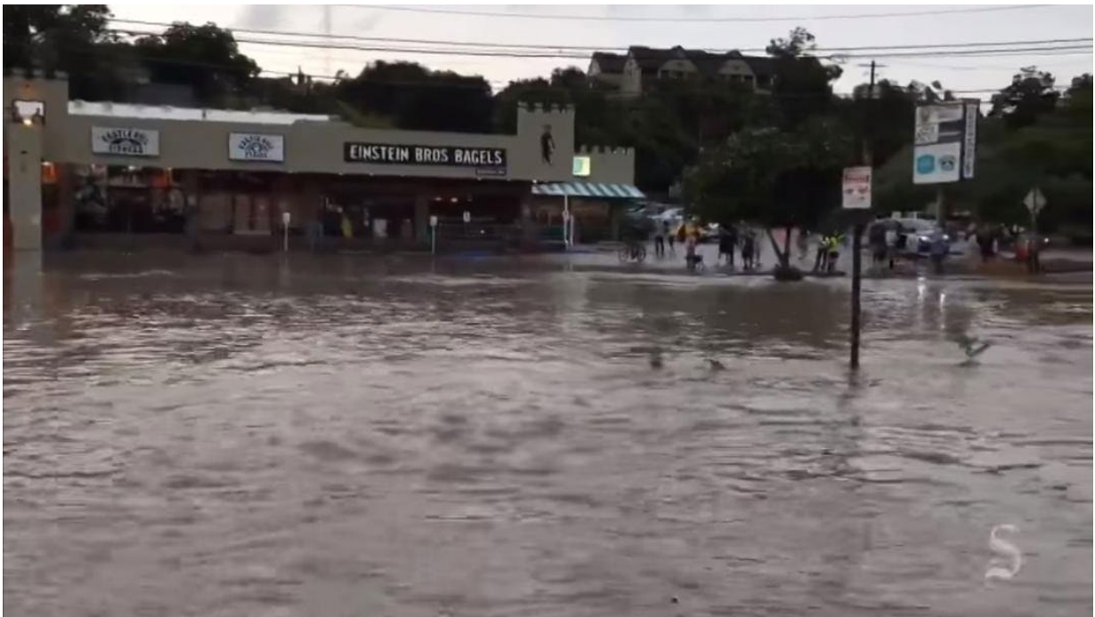
1112 N. Lamar Blvd.