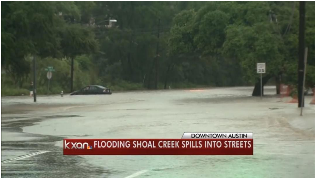
PROPERTY ACROSS THE STREET from 1901 N. Lamar Blvd. (On the same side of Lamar at the intersection of MLK, Jr. and N. Lamar Blvd)