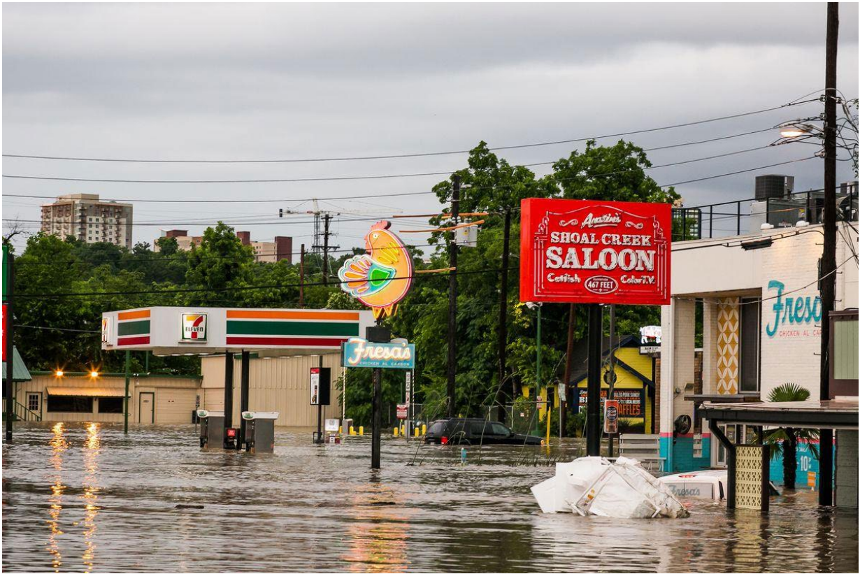
909 N. Lamar Blvd.

4. There is a magnificent heritage Live Oak tree on the edge of this property that is approximately 300 years old. Any underground activity OR increase in impervious cover will most likely damage the roots and cause danger to the tree. We have fewer and fewer of these heritage trees around Austin, and the protection of this tree is important to the neighborhood and to the city.