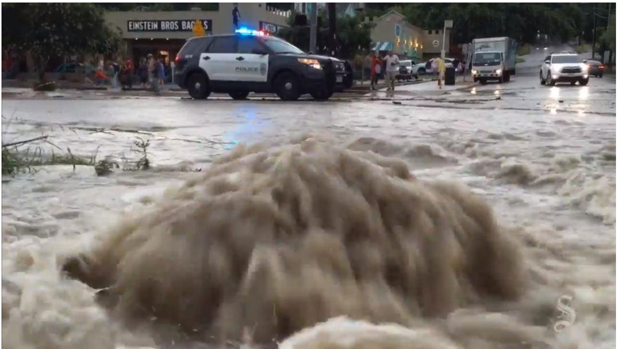
1112 N. Lamar Blvd.