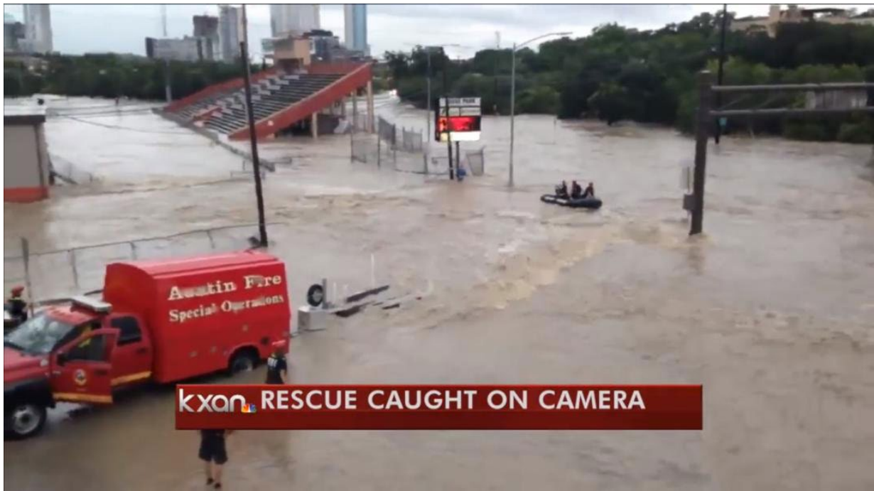
House Park/15th Street/Lamar Blvd.