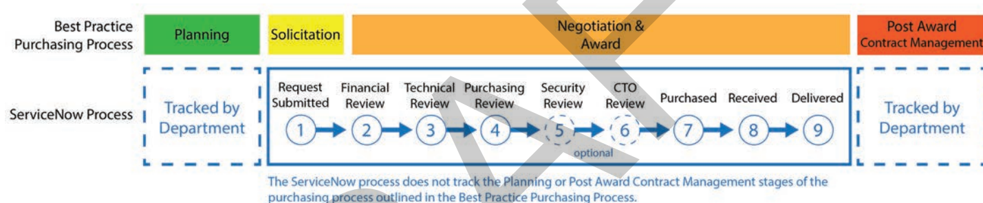
Exhibit 2: CTM's tool does not track information from all four phases of the technology purchasing process