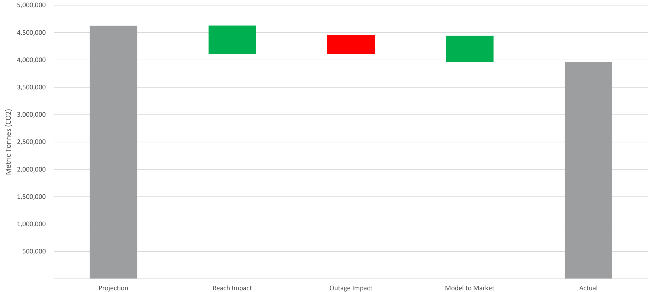
Emission Reduction Explained - 2021