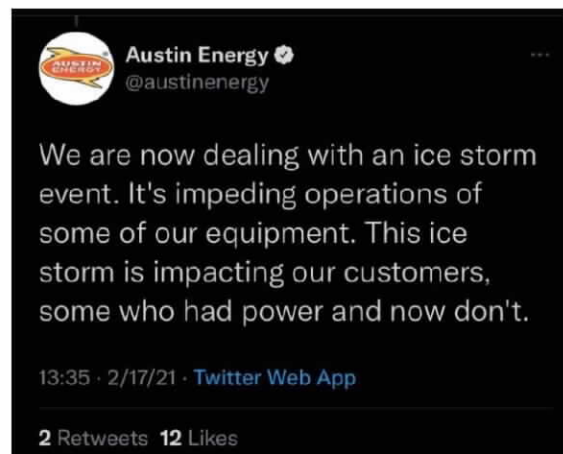
Figure 2: A contemporaneous tweet from Austin Energy which reads, "We are now dealing with an ice storm event. It's impeding operations of some of our equipment. This ice storm is impacting our customers, some who had power and now don't." It received 2 retweets and 12 likes on February 17 th , 2021, at 1:35pm.

The community should be educated about emergency preparedness ahead of time – e.g., insulate pipes, keep emergency supplies, how to shut off water, who to contact or where to go in an emergency.