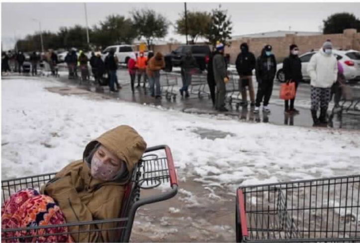
Figure 5: This photo shows someone sleeping in a shopping cart in the foreground of an snowy parking lot, where a line of people in heavy winter clothes stretches off into the distance.

Food provided at some shelters was inadequate, unhealthy or not culturally appropriate, and non-perishable ready-to-eat meals (MRE's) had instructions only in English. Water was provided in plastic bottles, which is not a sustainable, environmentally friendly solution.