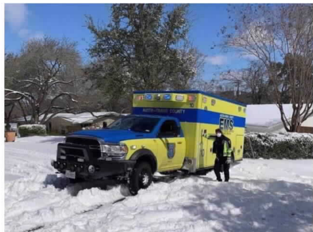
Figure 6: A paramedic leans against an EMS Vehicle trapped in the snow.

There was confusion about who should be making decisions and providing services, since this was a statewide disaster. Was the lack of energy a city or state failure? Where should state or federal authorities provide resources and support?