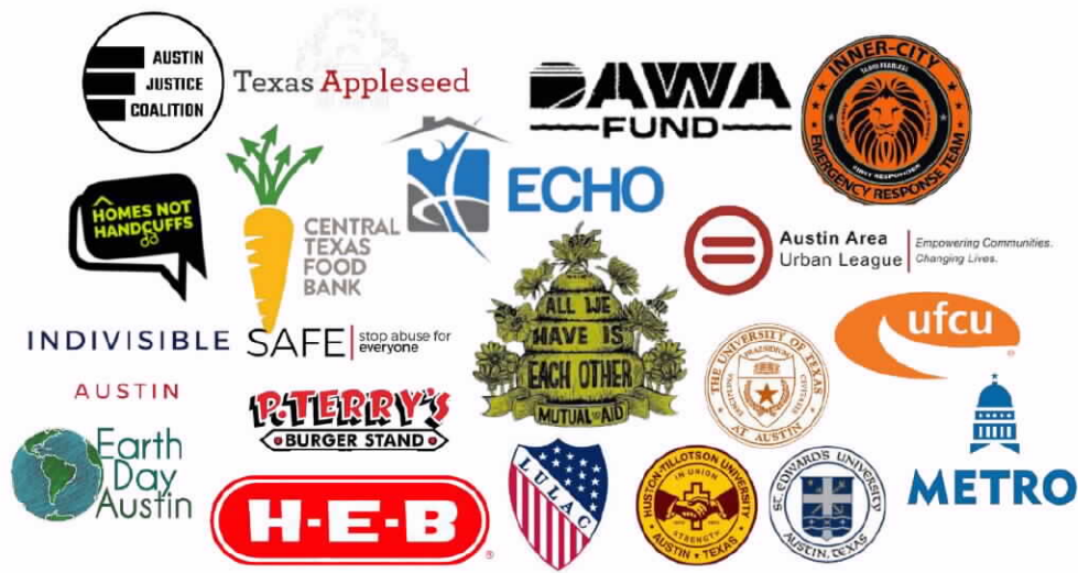
Figure 8: A depiction of the logos for a handful of organizations that lent their support to the community during the storm, including Austin Justice Coalition; Homes Not Handcuffs; Texas Appleseed; DAWA Fund; Central Texas Food Bank; Indivisible Austin; Earth Day Austin, P. Terry's Burger Stand; SAFE Alliance; HEB; LULAC; Austin Mutual Aid; ECHO; Austin Area Urban League; 10,000 Fearless Emergency Response Team; UFCU; CAP Metro; Huston-Tillotson University; St. Edward's University; and The University of Texas at Austin.