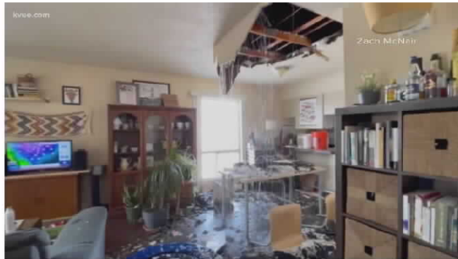
Figure 7: An apartment is completely destroyed by a large hole in the ceiling where ice and water spill out onto a dining room table.

The city needs to address emergency services training and procedures to be able to operate continually and act in emergency weather situations.