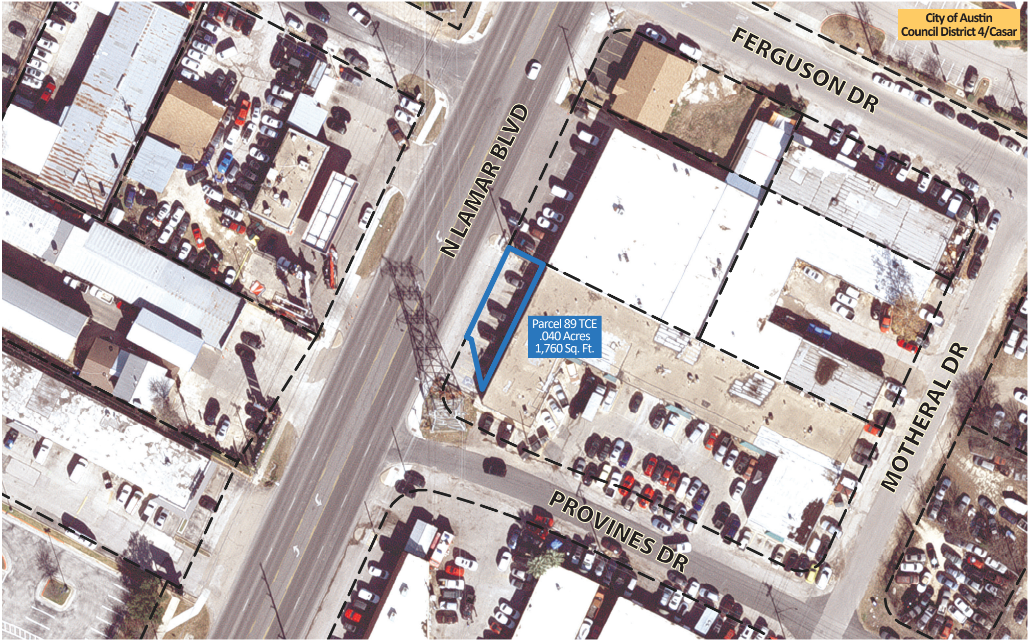
2021 Aerial Imagery, City of Austin