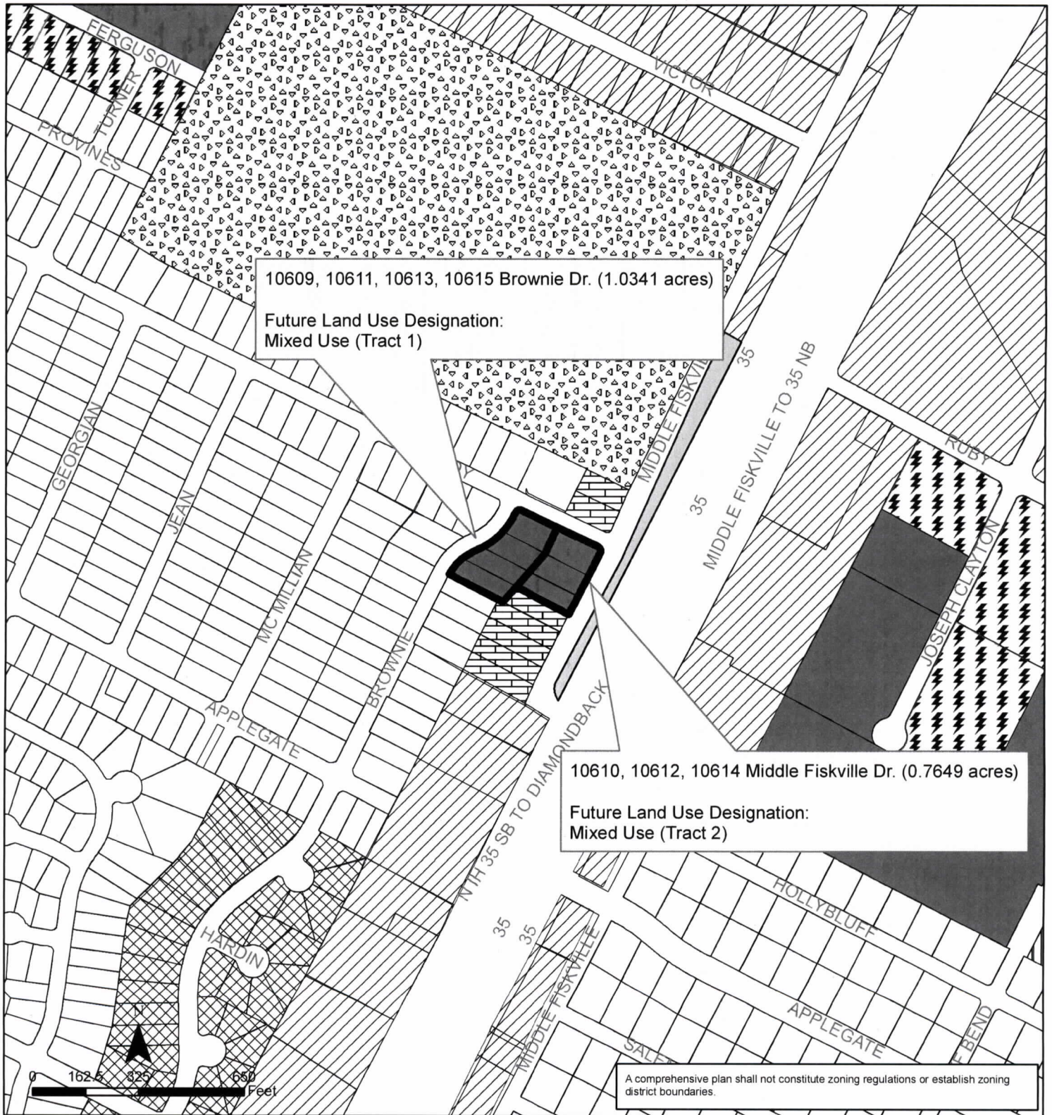
Exhibit A North Lamar Combined (North Lamar) Neighborhood Planning Area NPA-2021-0026.01

This product is for informational purposes and may not have been prepared for or be suitable for legal, engineering, or surveying purposes. It does not represent an on-the-ground survey and represents only the approximate relative location of property boundaries.