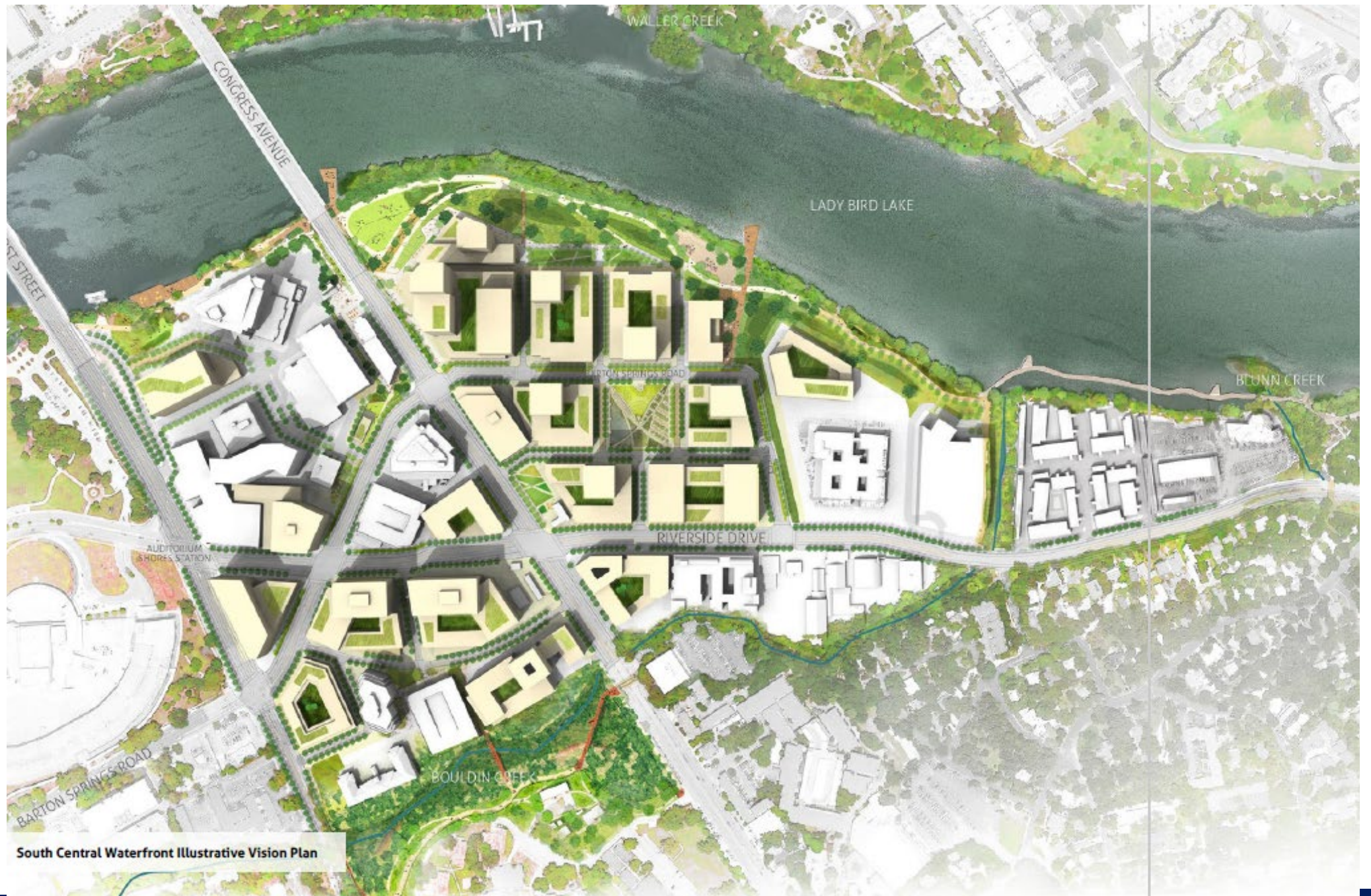
South Central Waterfront Illustrative Vision Plan