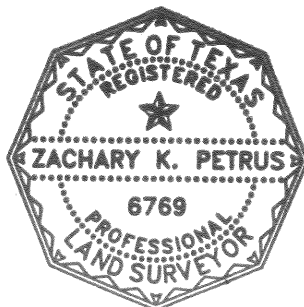
EXHIBIT "A" BOUNDARY EXHIBIT OF: TRACT 2 - 13.367 ACRE TRACT BEING OUT OF THE A. J. BOND SURVEY, ABSTRACT 91 CITY OF AUSTIN, TRAVIS COUNTY, TEXAS