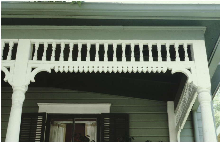
Texas Historical Commission. [Historic Property, Photograph 3491-07], photograph, Date Unknown; ( https://texashistory.unt.edu/ark:/67531/metaph968071/m1/1/?q=%22902%20e%207th%22 : accessed April 15, 2022), University of North Texas Libraries, The Portal to Texas History, https://texashistory.unt.edu ; crediting Texas Historical Commission.