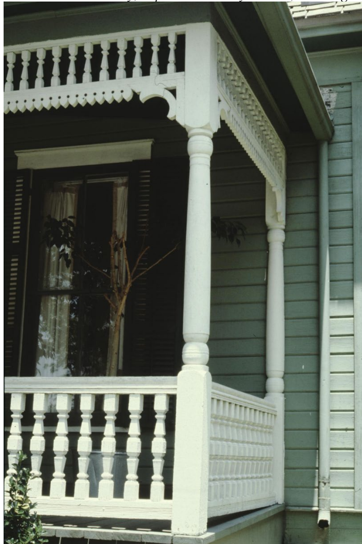
Texas Historical Commission. [Historic Property, Photograph 3491-02], photograph, Date Unknown; ( https://texashistory.unt.edu/ark:/67531/metaph960046/m1/1/?q=%22902%20e%207th%22 : accessed April 15, 2022), University of North Texas Libraries, The Portal to Texas History, https://texashistory.unt.edu ; crediting Texas Historical Commission.