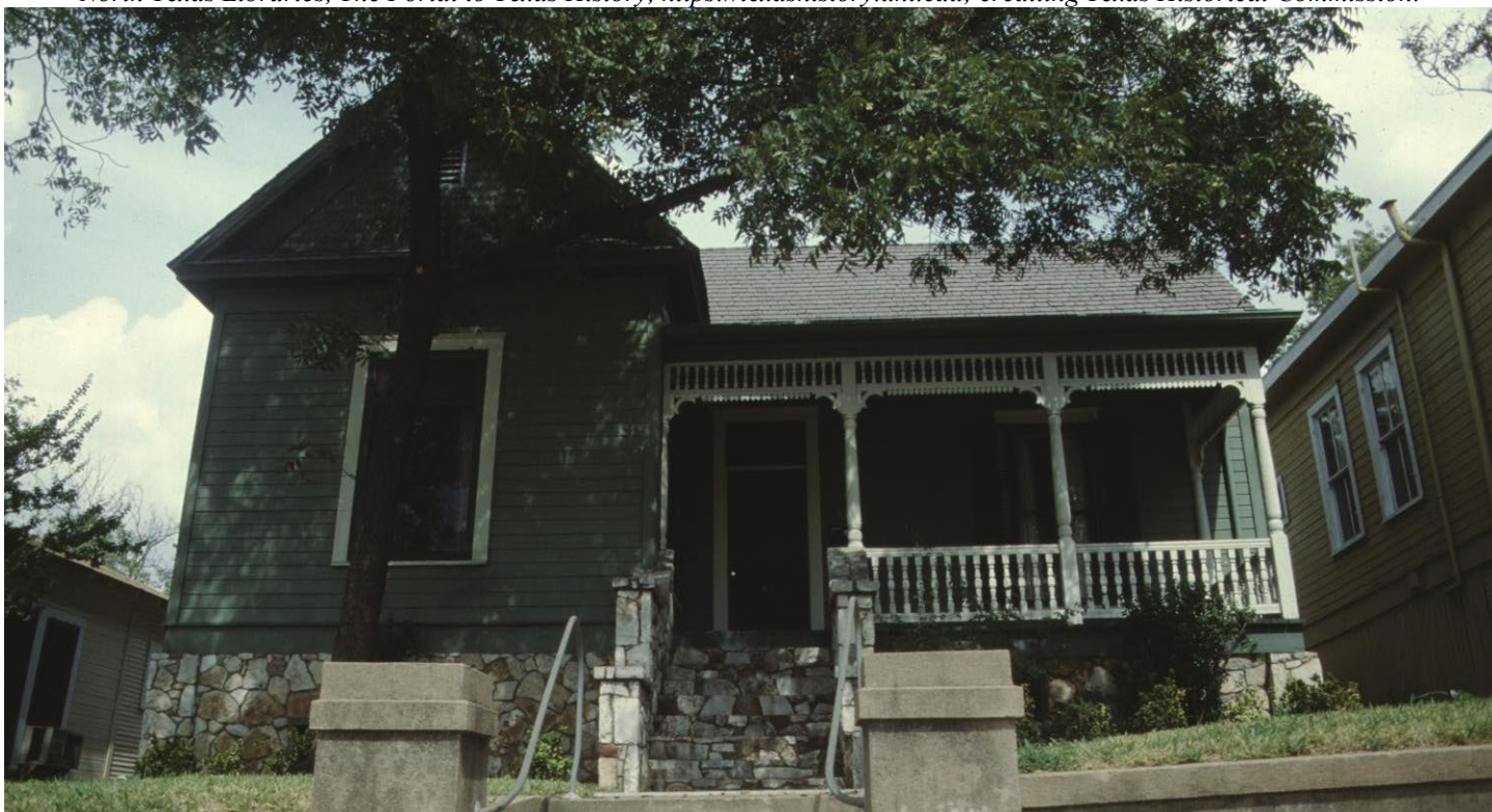
Texas Historical Commission. [Historic Property, Photograph 3358-17], photograph, September 1, 1984; ( https://texashistory.unt.edu/ark:/67531/metaph970947/m1/1/?q=%22902%20e%207th%22 : accessed April 15, 2022), University of North Texas Libraries, The Portal to Texas History, https://texashistory.unt.edu ; crediting Texas Historical Commission.