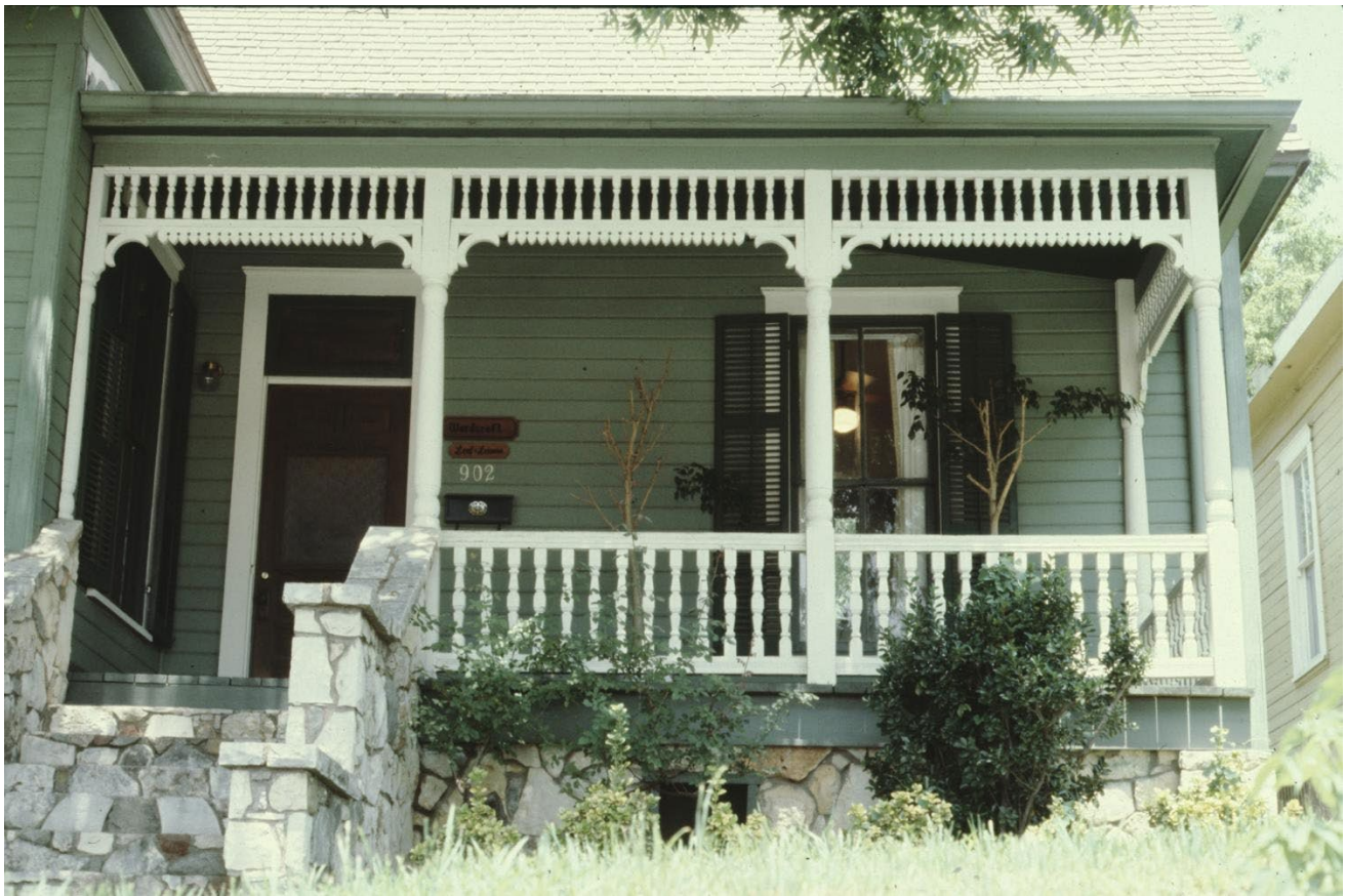
Texas Historical Commission. [Historic Property, Photograph 3491-05], photograph, Date Unknown; ( https://texashistory.unt.edu/ark:/67531/metaph963951/m1/1/?q=%22902%20e%207th%22 : accessed April 15, 2022), University of North Texas Libraries, The Portal to Texas History, https://texashistory.unt.edu ; crediting Texas Historical Commission.