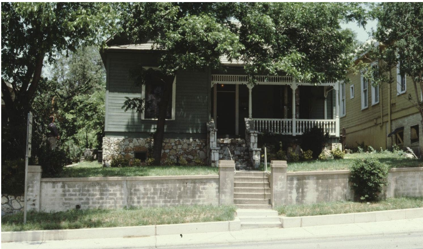
Texas Historical Commission. [Historic Property, Photograph 3491-08], photograph, Date Unknown; ( https://texashistory.unt.edu/ark:/67531/metaph970097/m1/1/?q=%22902%20e%207th%22 : accessed April 15, 2022), University of North Texas Libraries, The Portal to Texas History, https://texashistory.unt.edu ; crediting Texas Historical Commission.