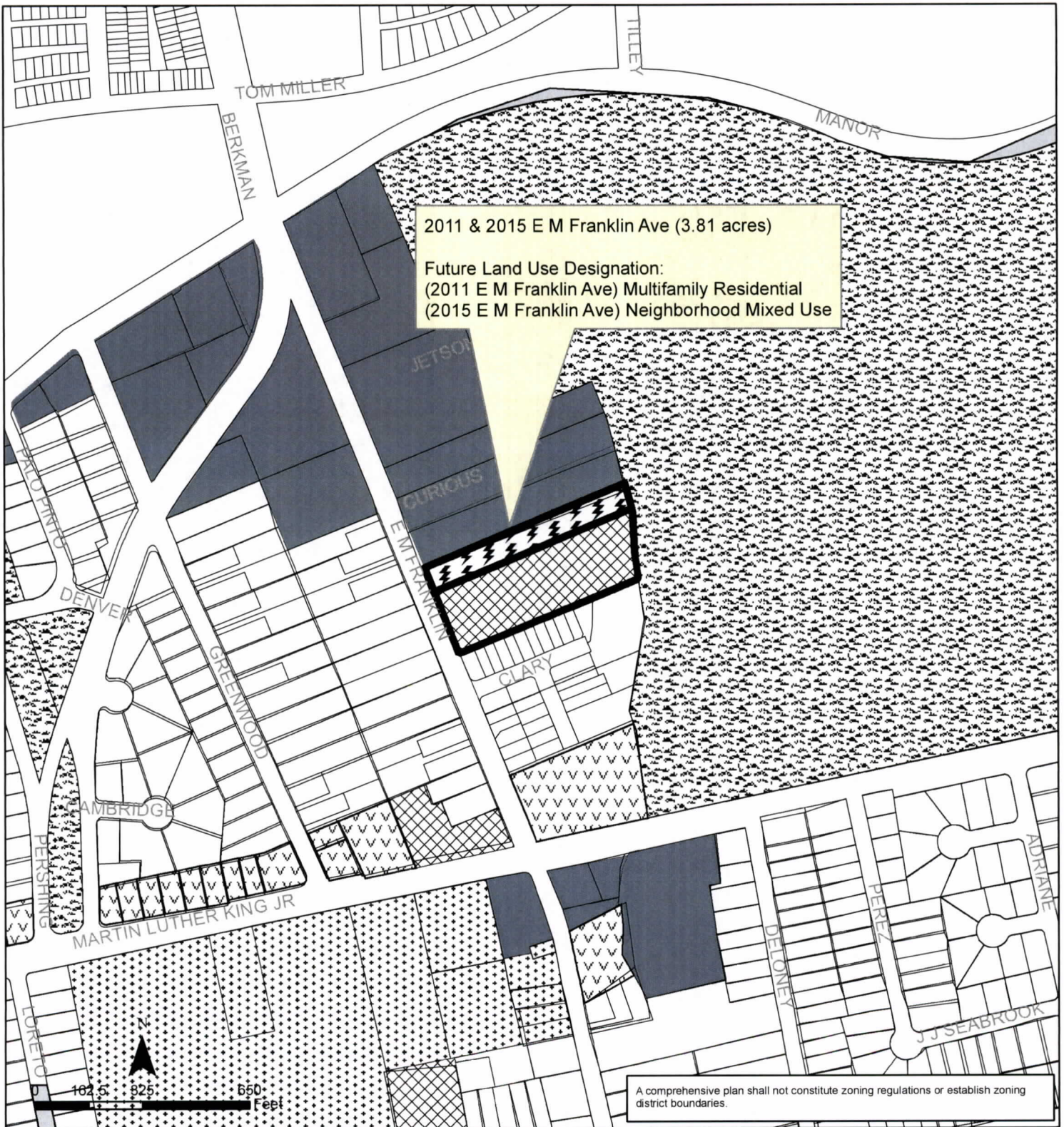
Exhibit A East MLK Combined (MLK-183) Neighborhood Planning Area NPA-2020-0015.02.SH

This product is for informational purposes and may not have been prepared for or be suitable for legal, engineering, or surveying purposes. It does not represent an on-the-ground survey and represents only the approximate relative location of property boundaries.