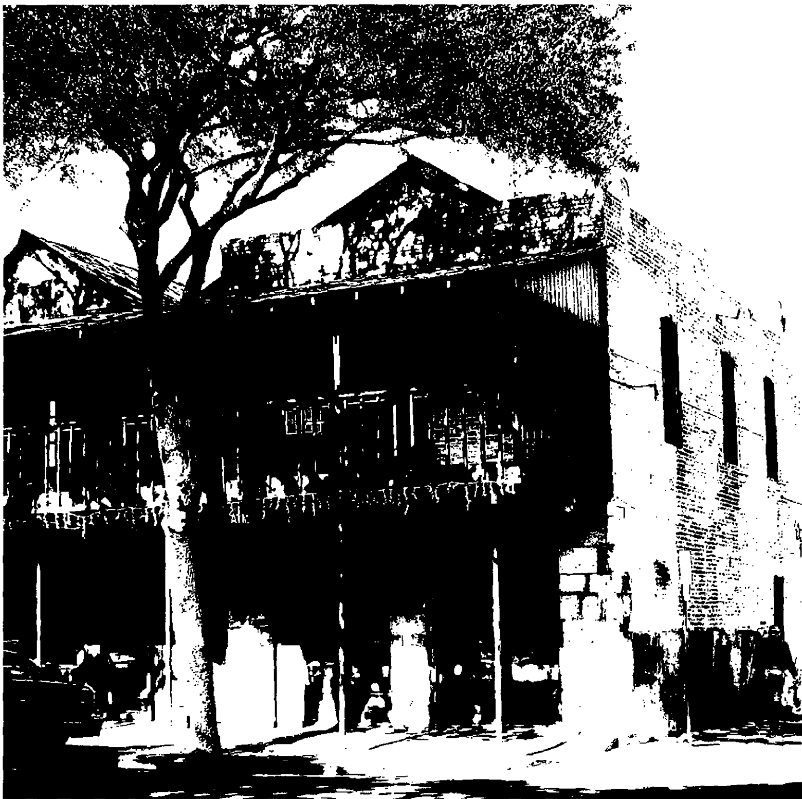
Photograph of the existing building at 708 East 6 th Street