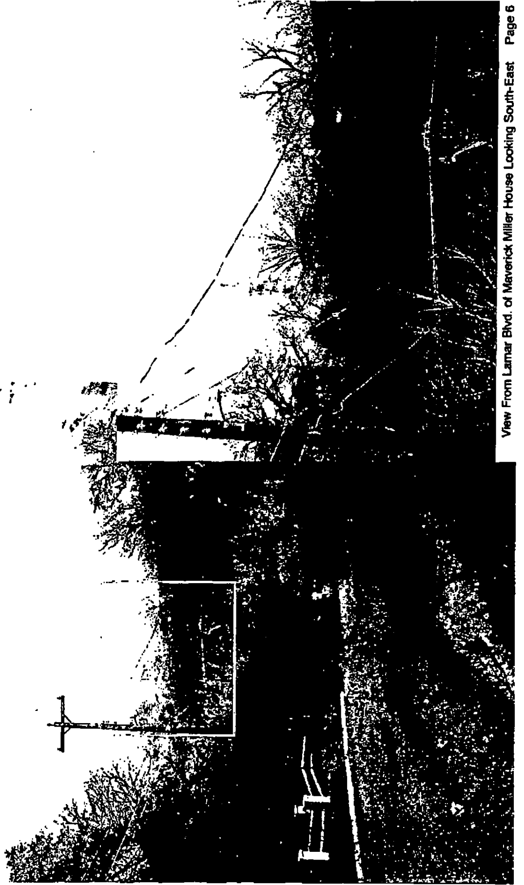
View From Lamar Blvd. of Maverick Miller House Looking South-East Page 6