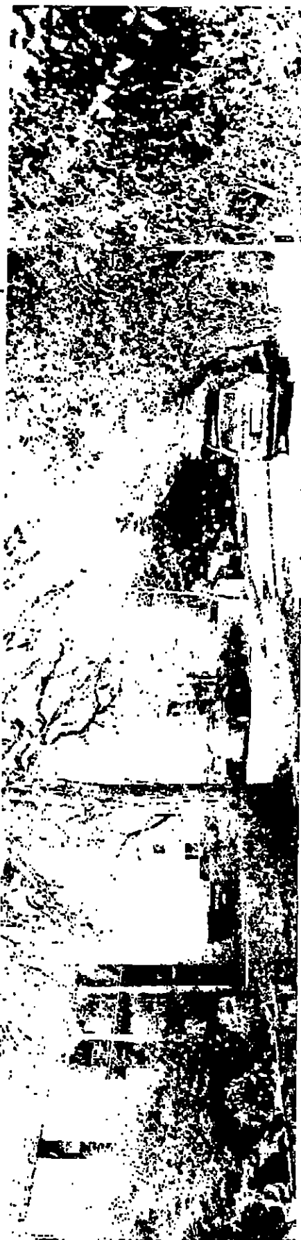
Poplar Looking West