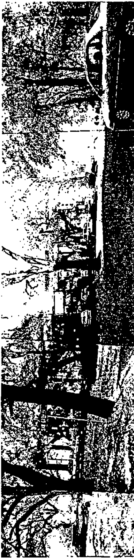
San Gabriel & Poplar Looking West