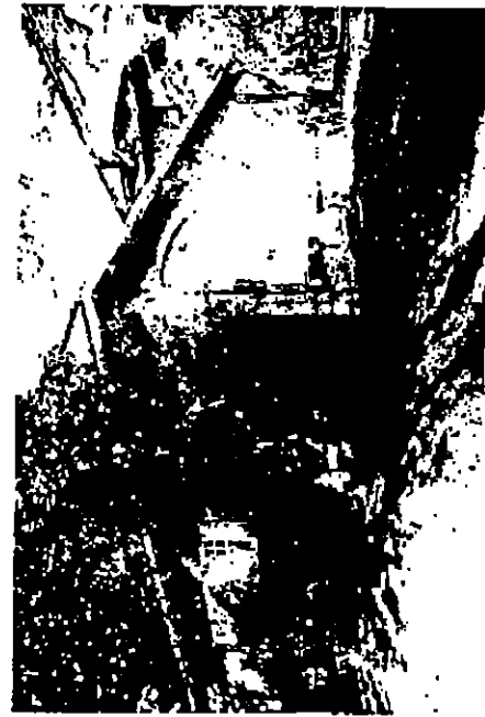
South East Oblique