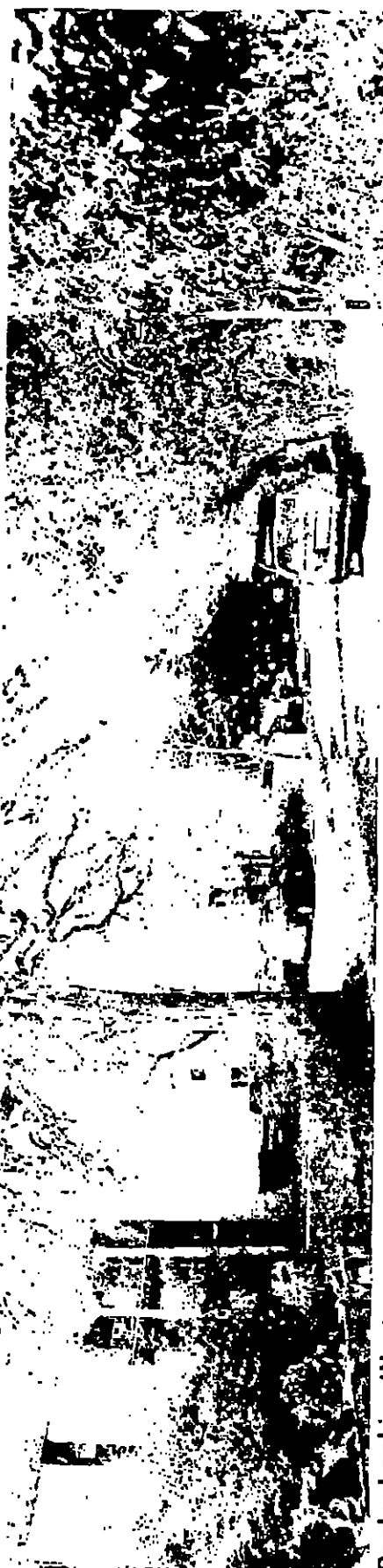
Poplar Looking West