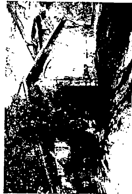
South East Oblique