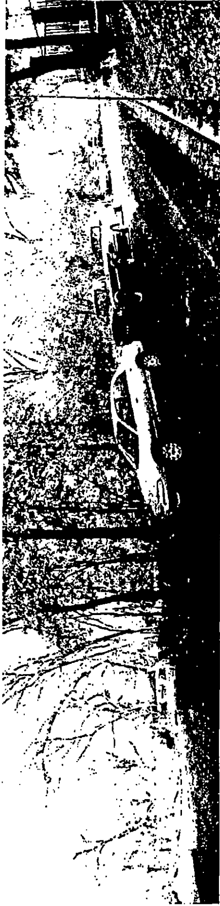
San Gabriel & Poplar Looking North-East