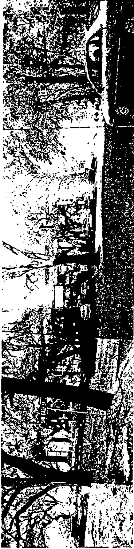
San Gabriel & Poplar Looking West