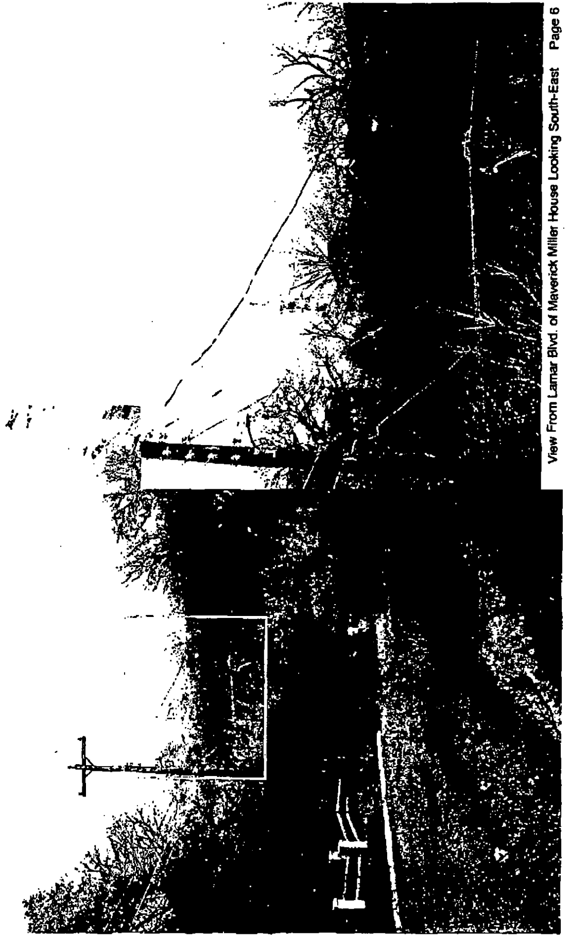
View From Lamar Blvd. of Maverick Miller House Looking South-East Page 6