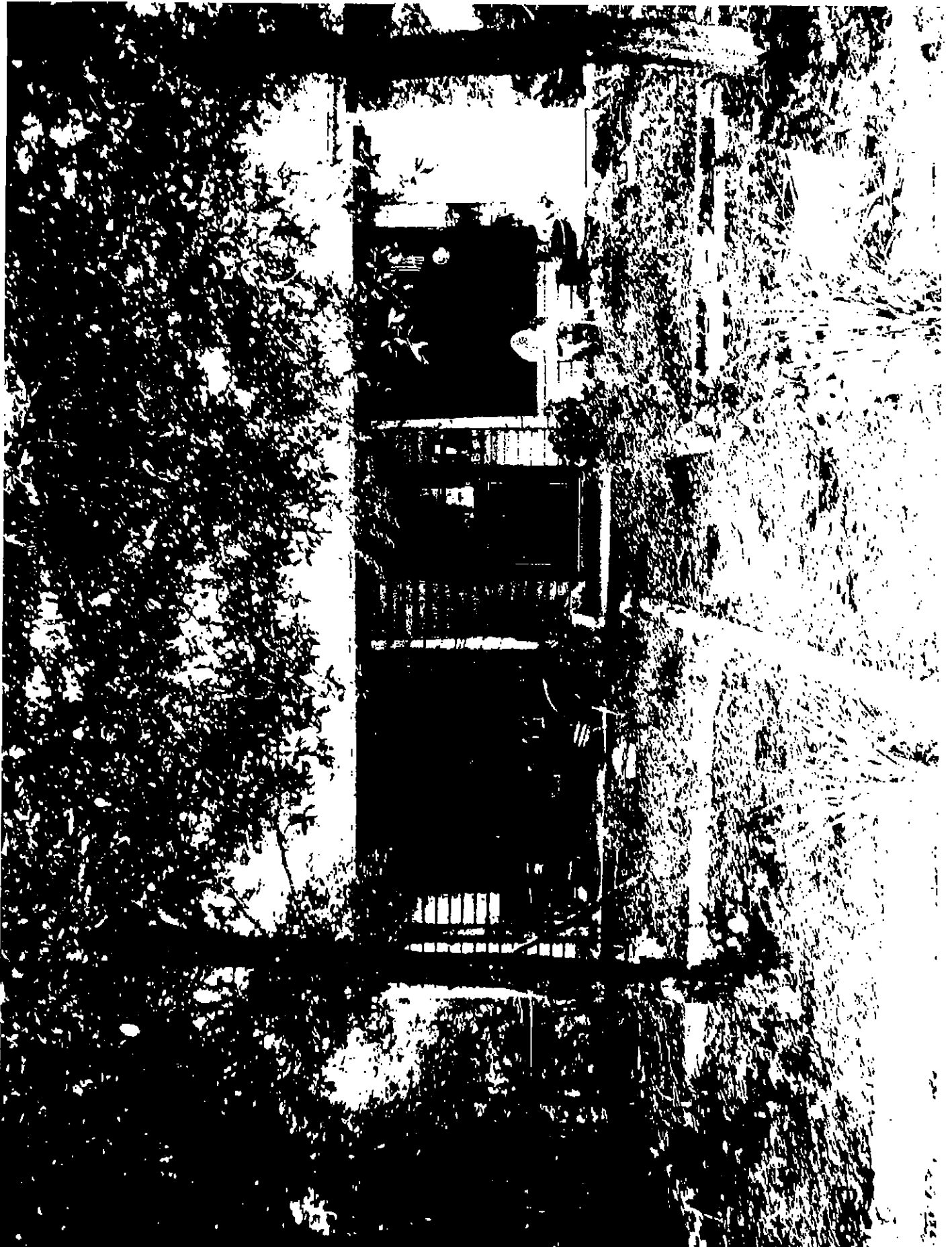
Photograph of existing Maykus house at 403 W. 55 ½ Street