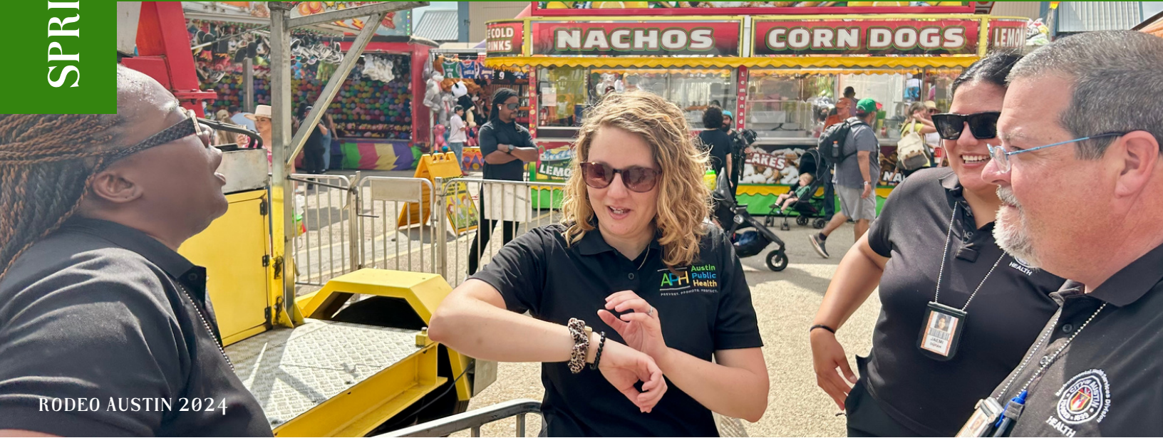
RODEO AUSTIN 2024