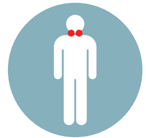
Swollen lymph nodes