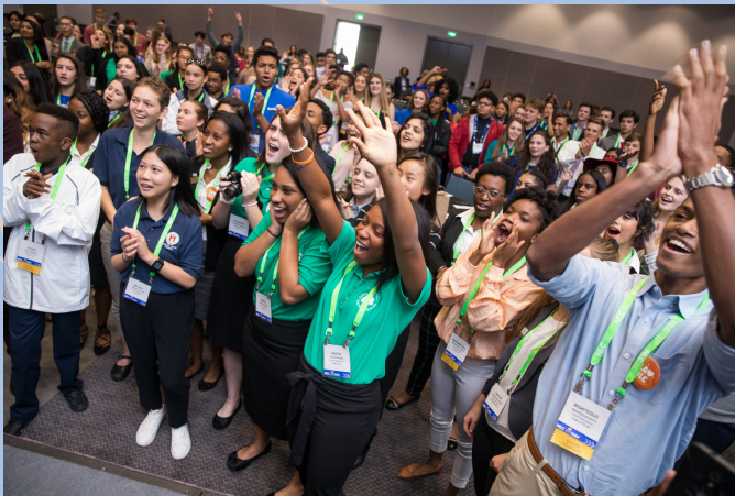
AYC members in an electrifying youth session (Los Angeles, CA)

National League of Cities hosts two annual conference: City Summit (held in a member-city every Fall) and Congressional Cities conference (held in Washington, D.C. in Spring.