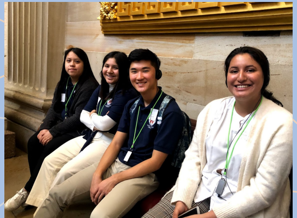
Touring the Capitol building in between conference sessions. (Washington, D.C.)

AYC students must be active and in good standing academically and within your local to be selected to attend.