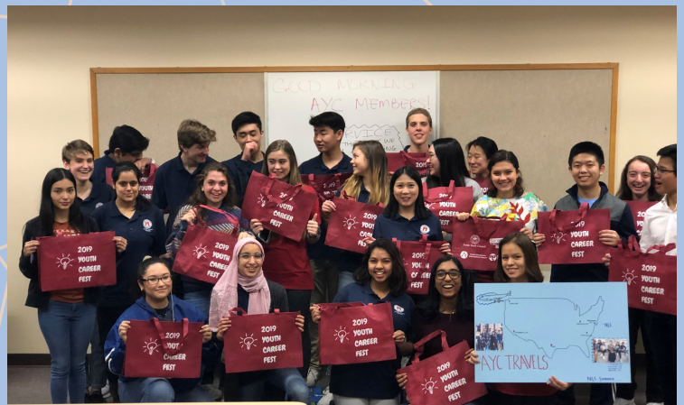
Community service project preparing for our annual Youth Career Fest

AYC is made up of over 65 high school students across Austin representing the youth population of Austin including students from AISD, DVISD, RRISD, PfISD, LISD, Charter Schools, Parochial Schools, Private Schools, and homeschooled students.