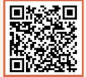
AAC Foster App

To join the foster program, we'll have some basic questions about your home. Complete our Foster Application: at: bit.ly/aacfosterapp