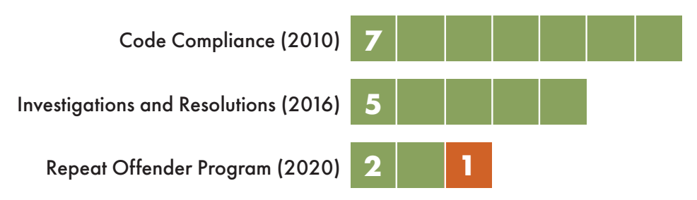
Exhibit 1. 14 recommendations are complete & 1 is in progress