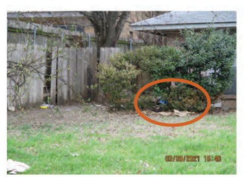
Exhibit 5. Inspectors documented trash in the original & subsequent inspections, but the second inspector still closed the case

During our follow-up work, we still found a few instances in which code inspectors did not handle cases consistently. For example, two inspectors separately documented trash in the same resident's yard. The first inspector took photos and entered the case into the case management system but did not issue a Notice of Violation. The second inspector followed up a week later. They also took photos showing some of the same pieces of litter and closed the case despite mostly unchanged conditions.