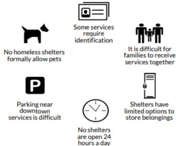
Exhibit 4: A person experiencing homelessness may face barriers when trying to access programs and services