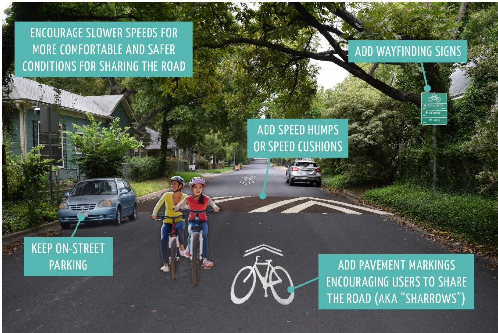
Figure 1 - Concept for a neighborhood bikeway / Figura 1- Ciclovías del vecindario

Las ciclovías del vecindario son calles con velocidades y volúmenes de tráfico de vehículos de motor más bajos donde la seguridad y la comodidad de las personas que andan en bicicleta, caminan y juegan en la calle es una prioridad. Los proyectos de ciclovías del vecindario pueden incluir marcas en el pavimento para alertar a las personas que conducen que deben esperar gente andando en bicicleta, intersecciones mejoradas de las calles principales, señales para guiar gente en bicicleta a destinos locales y regionales, y herramientas de reducción de velocidad (como topes o reductores de velocidad). El proyecto propuesto incluye cambios en Wilshire Boulevard, Cherrywood Road y Schieffer Avenue y mejoras para cruzar IH-35. Un diseño preliminar estará disponible en la reunión pública del proyecto el martes 24 de septiembre de 7:00 a 8:00 p.m. para que lo revise y envíe sus comentarios. Favor de contactar Sophia Benner para preguntas, comentarios, o traducción de materiales de proyectos en línea al 512-974-7853 o sophia.benner@austintexas.gov . El periodo para comentarios estará abierto hasta domingo el 27 de octubre de 2019. Visite el sitio web del proyecto para más información: austintexas.gov/cherrywoodbikeways