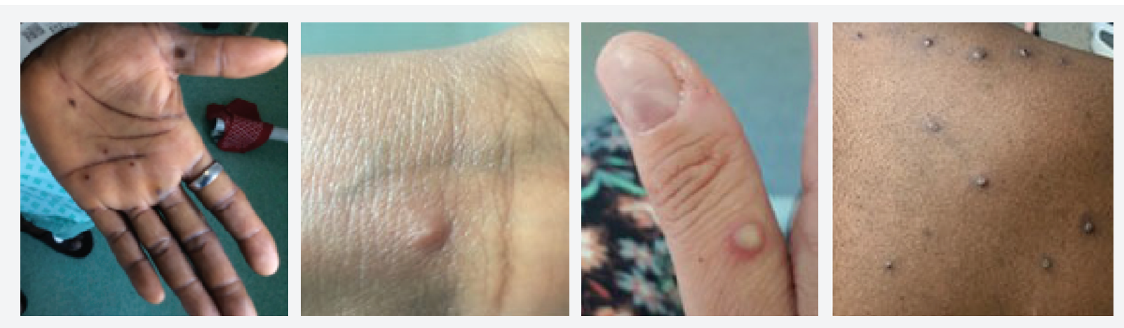
Date updated: 02/14/2023