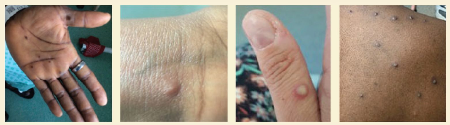
Date updated: 8/7/2023