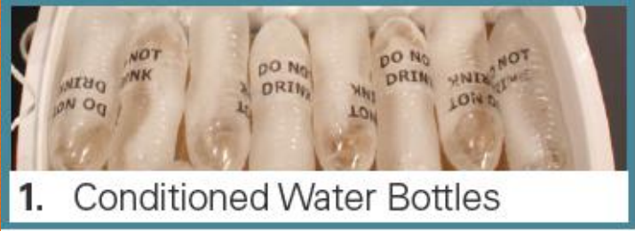
1. Conditioned Water Bottles

LINE CONDITIONED BOTTLES ON BOTTOM OF COOLER