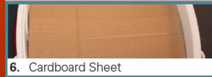
6. Cardboard Sheet