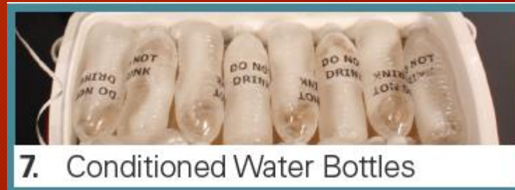
7. Conditioned Water Bottles

ADD THE REST OF THE PREPPED BOTTLES AND CLOSE LID. PLUG IN LOGGER AND POWER UP; MAKE SURE LOGGER IS CONFIGURED FOR REFRIGERATED TEMPERATURES.