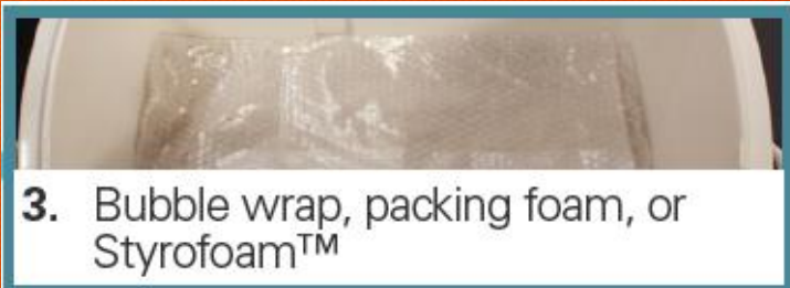
3. Bubble wrap, packing foam, or Styrofoam™

ADD LAYER OF BUBBLE WRAP ON TOP OF CARDBOARD