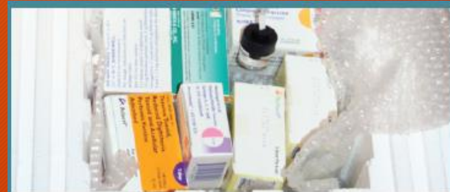
4. Vaccines, Diluents, and Temperature Monitoring Device Probe

PLACE TEMPERATURE READY PROBE IN CENTER ENSURING THE CORD REACHES TO OUTSIDE OF COOLER TO PLUG IN LOGGER, ADD VACCINES.