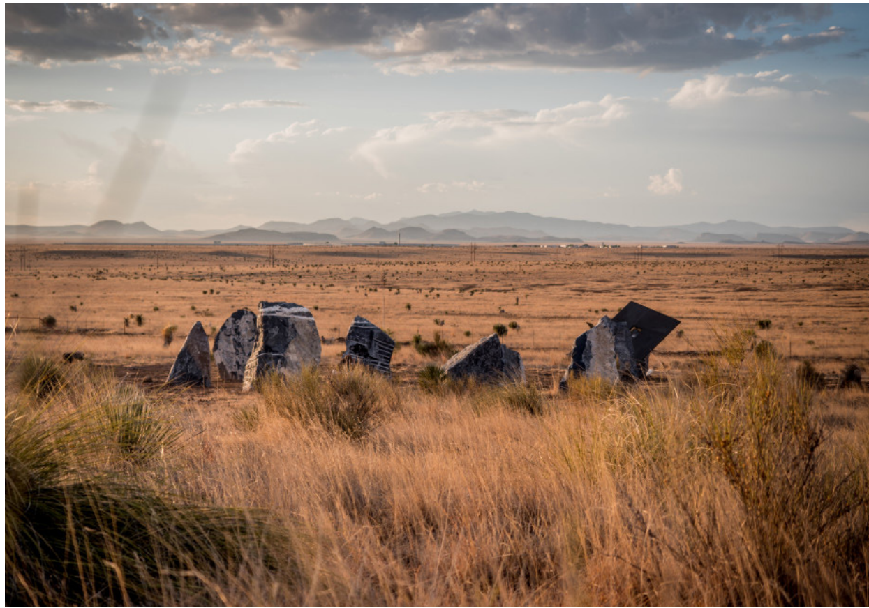
Local Natural Materials