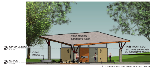
3 SOUTH ELEVATION 1/8" = 1'-0"