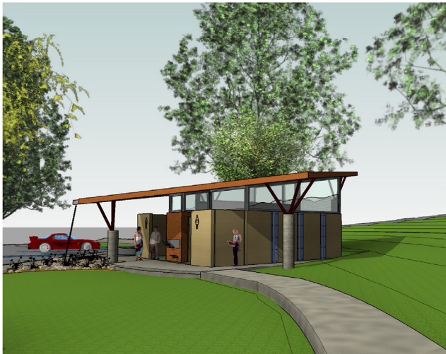
2 PERSPECTIVE 1/8" = 1'-0"