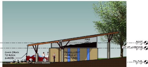
4 EAST ELEVATION 1/8" = 1'-0"