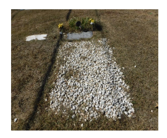
City of Austin Cemeteries is seeking uniform and consistent rules and regulations similar to other City Municipalities.