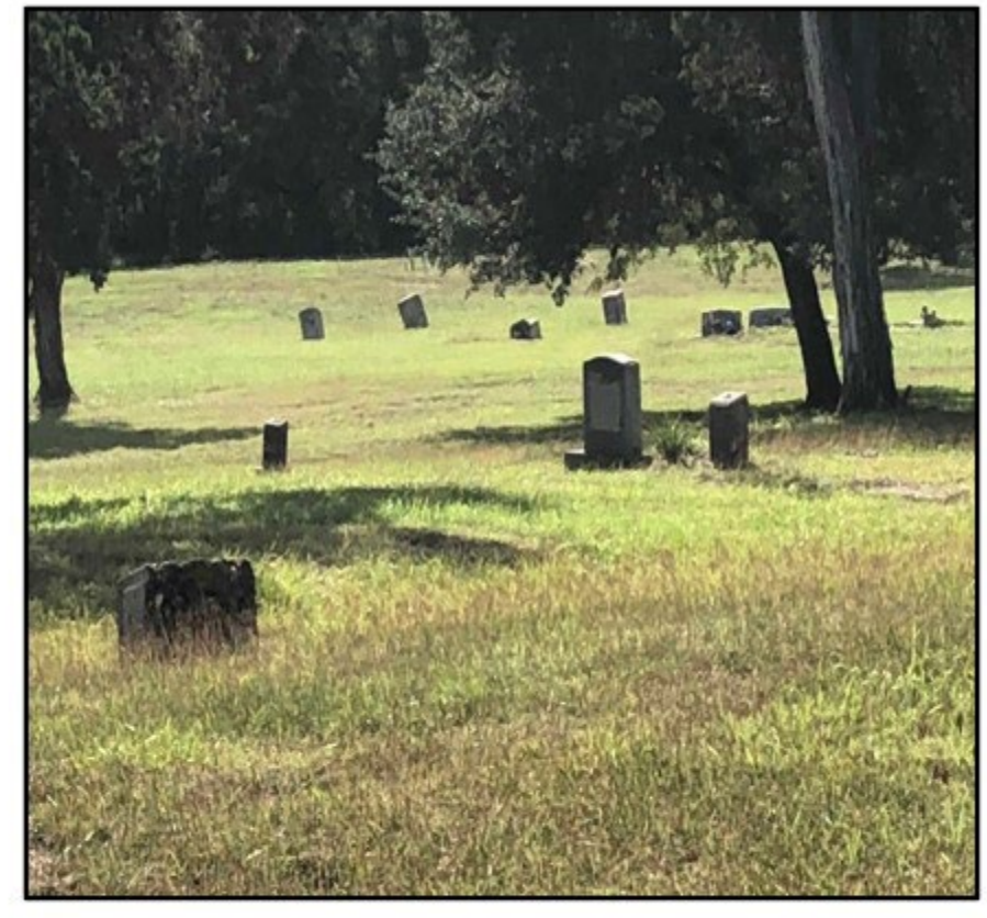
City of San Antonio Cemetery