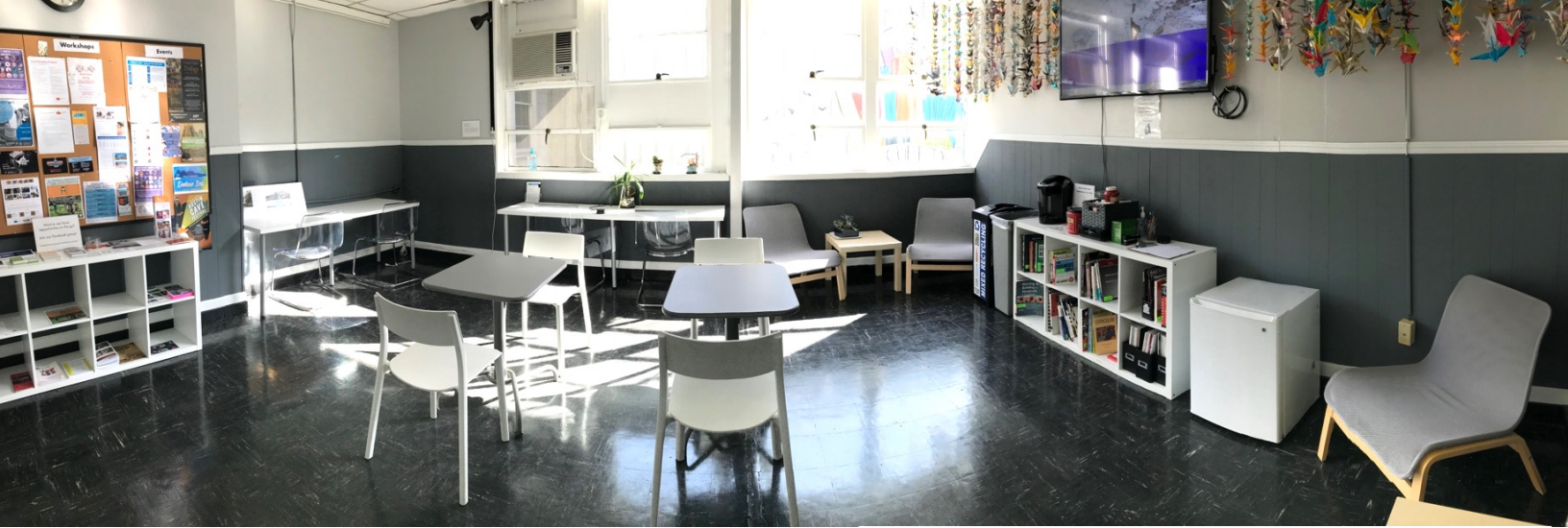
The Artist Resource Center at the Dougherty Arts Center.