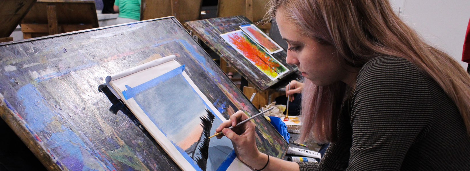
A student adds finishing touches to her piece in the Adult Beginning Acrylic Painting Class.