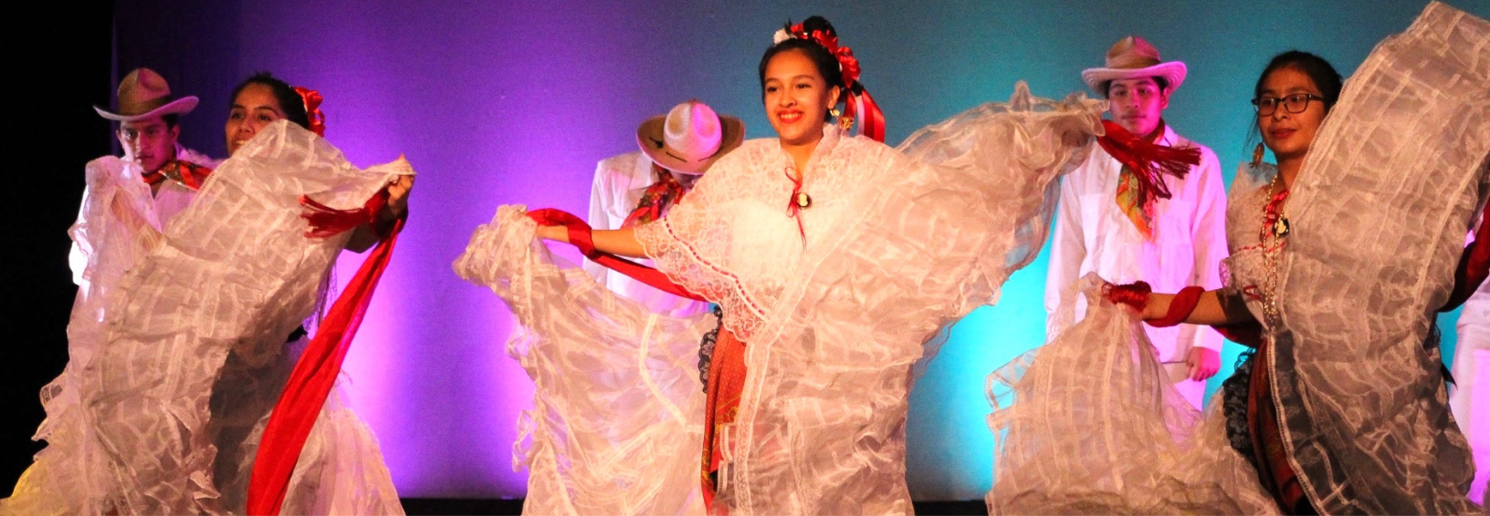
Ballet East performs in the Dougherty Art Center's theater.