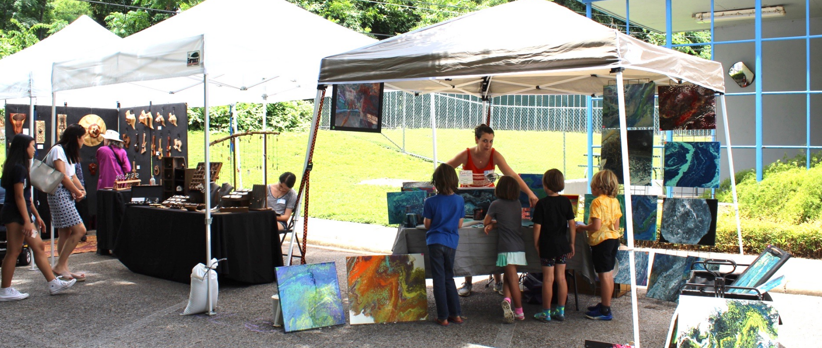
Local artists share their artwork with community members at the Austin Art-O-Rama.