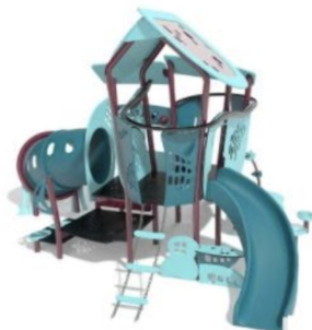
View A / Ver A