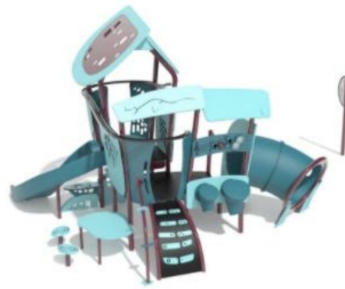
View B / Ver B