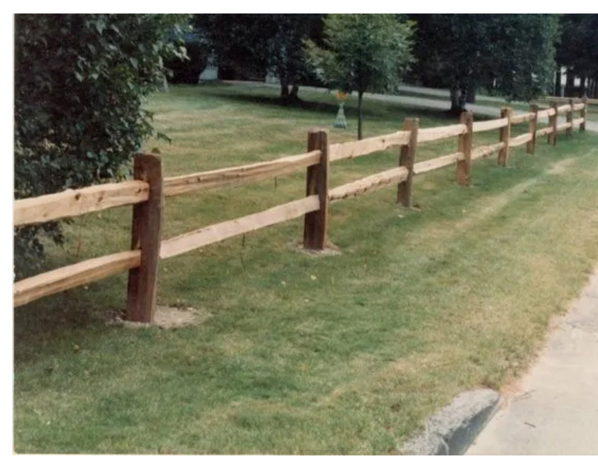
EXISTING STREET PARKING FENCE