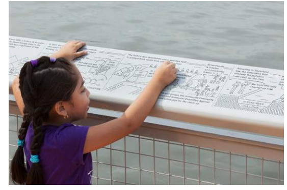
Accessible from a multitude of Viewpoints