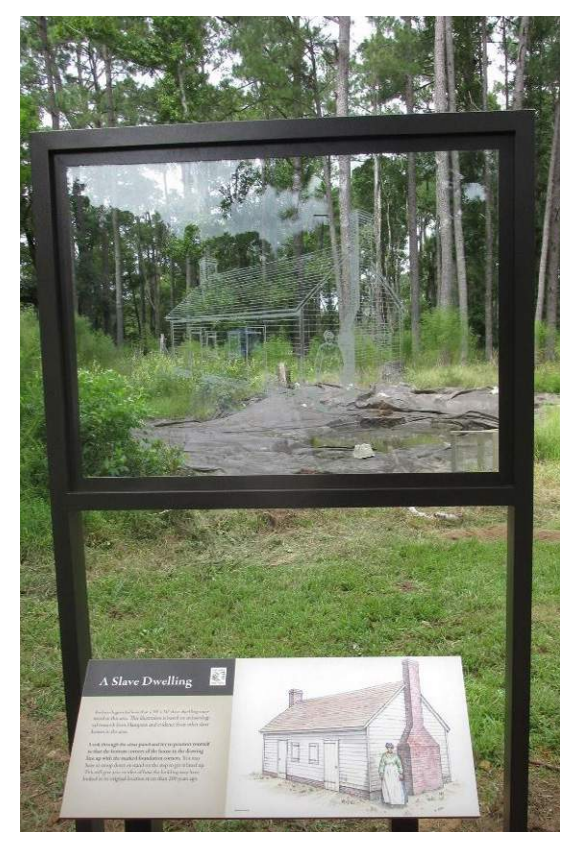
Layering Interpretive Signage

Beyond the text and images on a sign, the design of the sign and its support structure are opportunities to engage visitors playfully and/or create a sense of place. At Zilker Park, appropriate design inspirations could include the park's New Deal-era architecture and its flora and fauna.