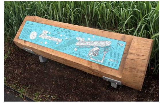
Interpretive Signage Located in Gathering Space