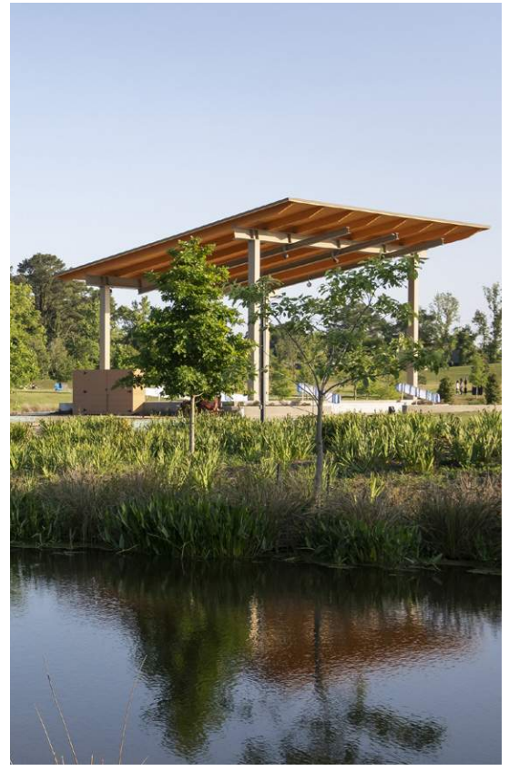
Outdoor Classroom with Interpretive Signages